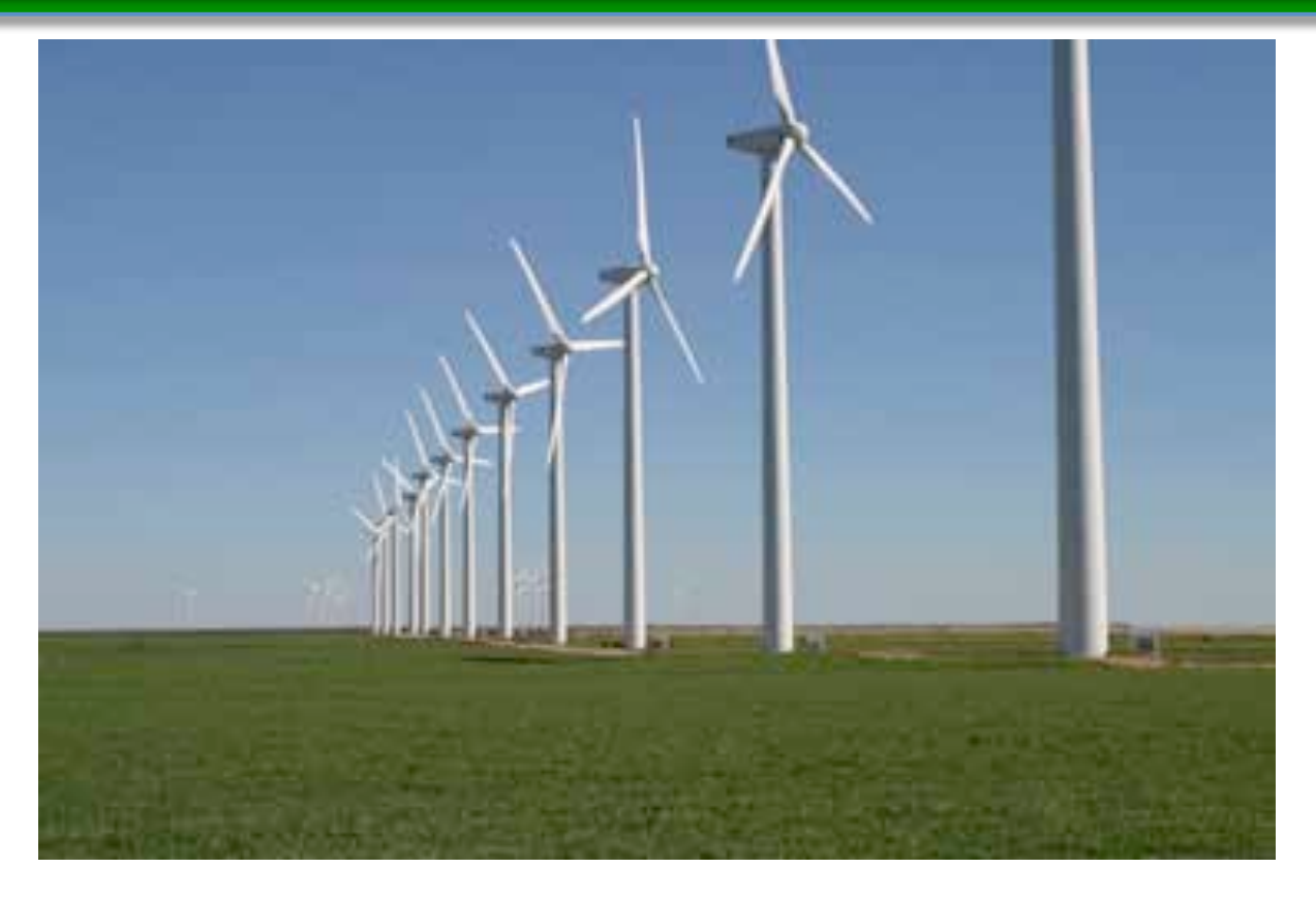
Green technologies for renewable energy generation from geothermal, solar and wind sources.

Although the country has largely relied on hydro-electric power generation for many decades, water levels in dams due to prolonged droughts as a result of climate change has adversely affected power generation leading rationing and power outages. The adoption of green initiatives in the energy sector is an important intervention as the country strives to become an emerging economy by 2030.