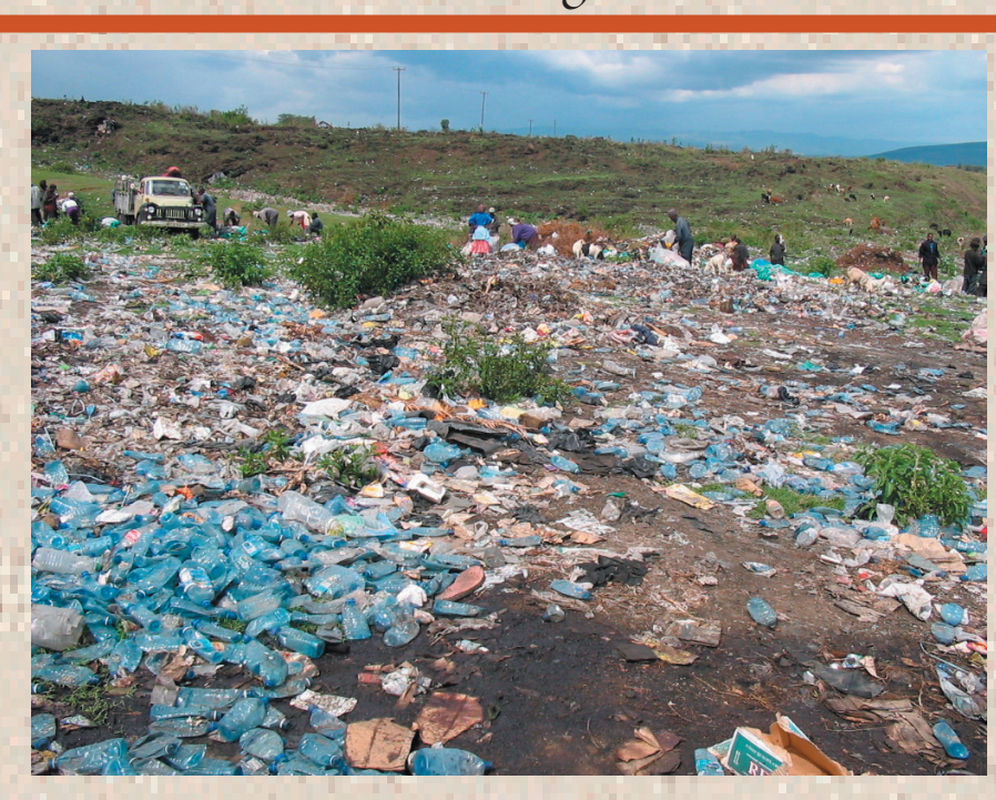
An open dump site with assorted Plastics