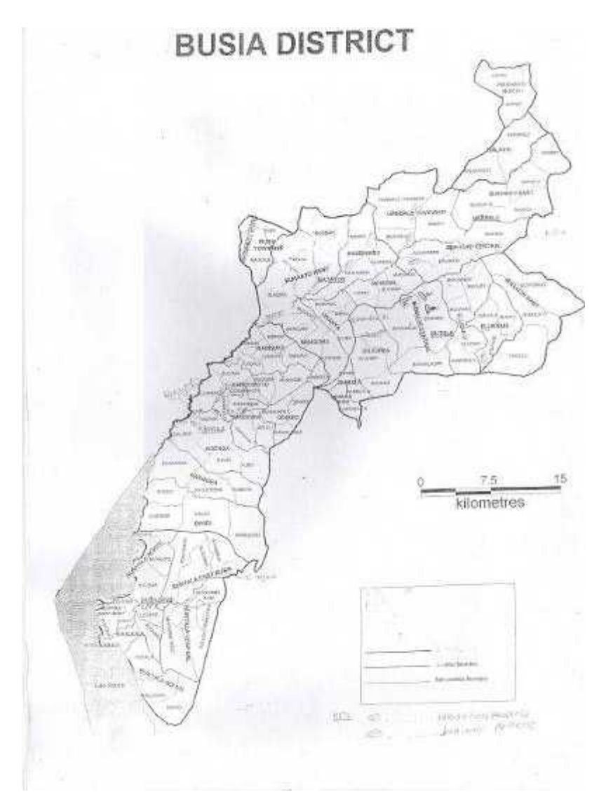
Figure 1: Map of Busia District Administrative Boundaries