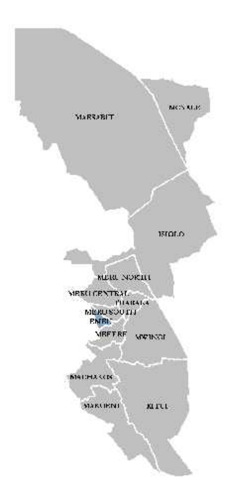
Figure 1: Location of Embu district

Embu district is one of the thirteen districts in Eastern Province (Figure 1) covering an area of 708 km² (with Mt. Kenya Forest Reserve and Mt. Kenya National Park occupying 210.2 km² which is about 30% and uninhabited) It borders Mbeere District to the east and south east, Kirinyaga District to the West and Meru South District to the North. The District lies approximately between latitudes 0°8′ and 0° 35′ south and longitudes 37°19′ and 37°42′ east.