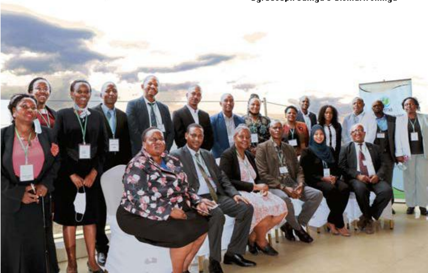
NEMA Kenya and South to South officials at Ole Sereni hotel in Nairobi during the workshop

L ack of finance remains the greatest existential threat especially to African countries in responding to vagaries of climate change.