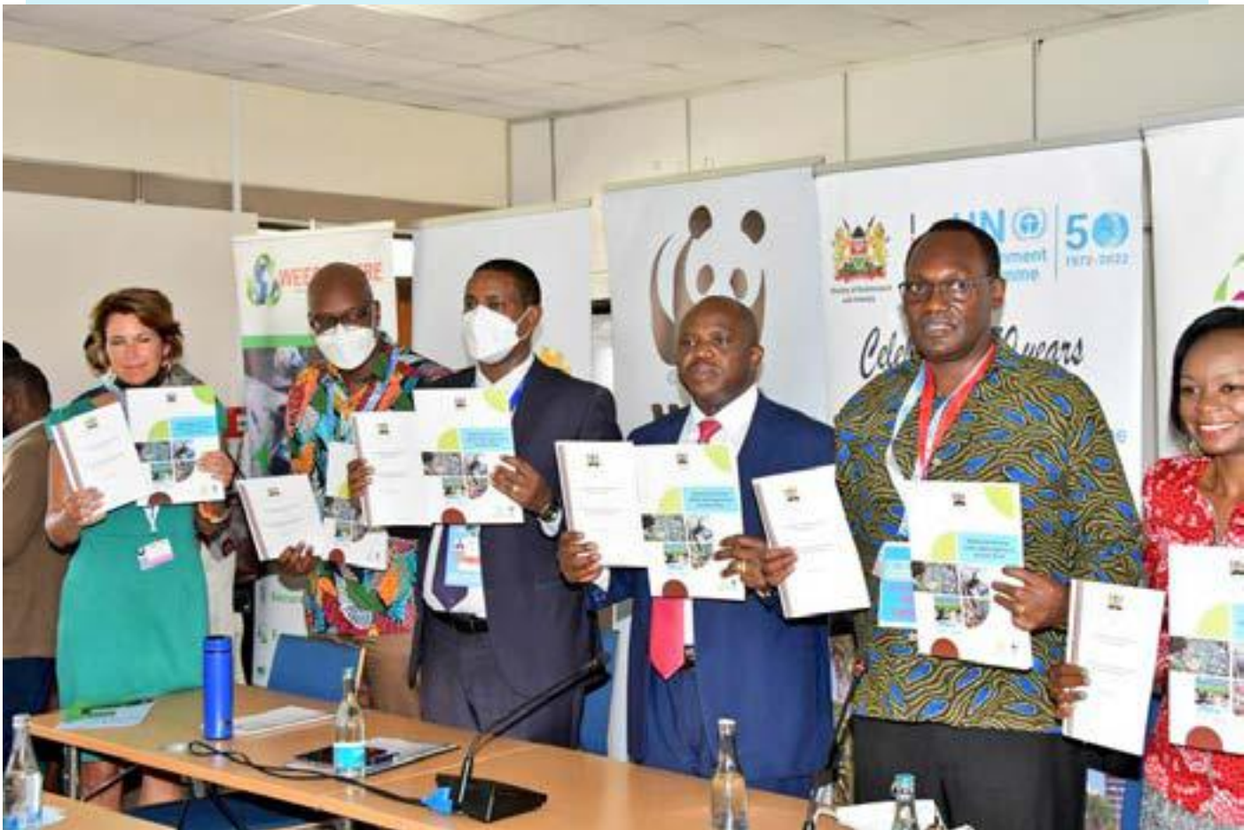
The launch of the National Marine Litter Management Action Plan (2021-2030) during the UNEA 5.2 in Nairobi