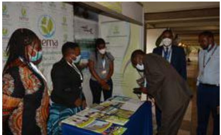
NEMA Staff, visitors at NEMA exhibition booth

UNEA brought together governments, businesses, civil society and other stakeholders to agree on policies to address the world's most pressing challenges. Chemicals and waste management, Marine litter and a green recovery from COVID-19 were some of the issues the UN Environment Assembly (UNEA 5.2) addressed when it convened for the resumed part of its fifth session. Environment ministers were expected to consider the adoption of a declaration on strengthening actions for nature to achieve the Sustainable Development Goals.