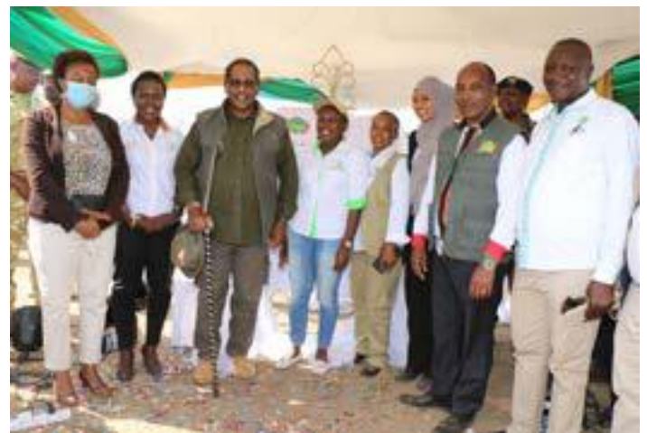
NEMA Board, Staff pose for a photo with CS Environment and Forestry, Keriako Tobiko and Governor Nyandarua, H.E Francis Kimemia during the launch

Development of the Lake Ol Bolossat Integrated Management plan was anchored under EMCA provisions. The plan development underwent all stages as guided by the Ramsar Convention including stakeholder consultation, expert field assessments and observations, focus group discussions, expert working groups and stakeholder validation.