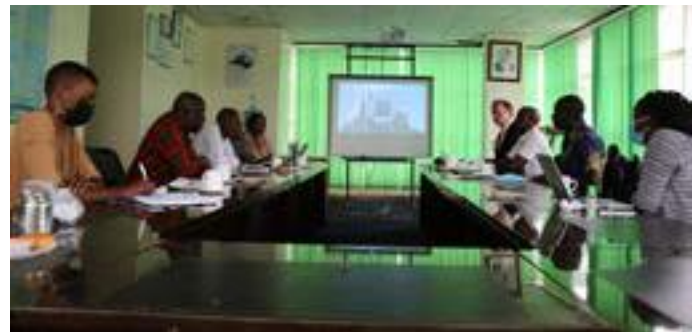
NEMA, County officials in a meeting at NEMA HQ

The team resolved to utilize the capacities, experiences and strengths of the partners to address environmental, waste management and climate change challenges in Kisumu city. The team further reviewed a draft concept note to address pollution and waste management in the Lakeside city.