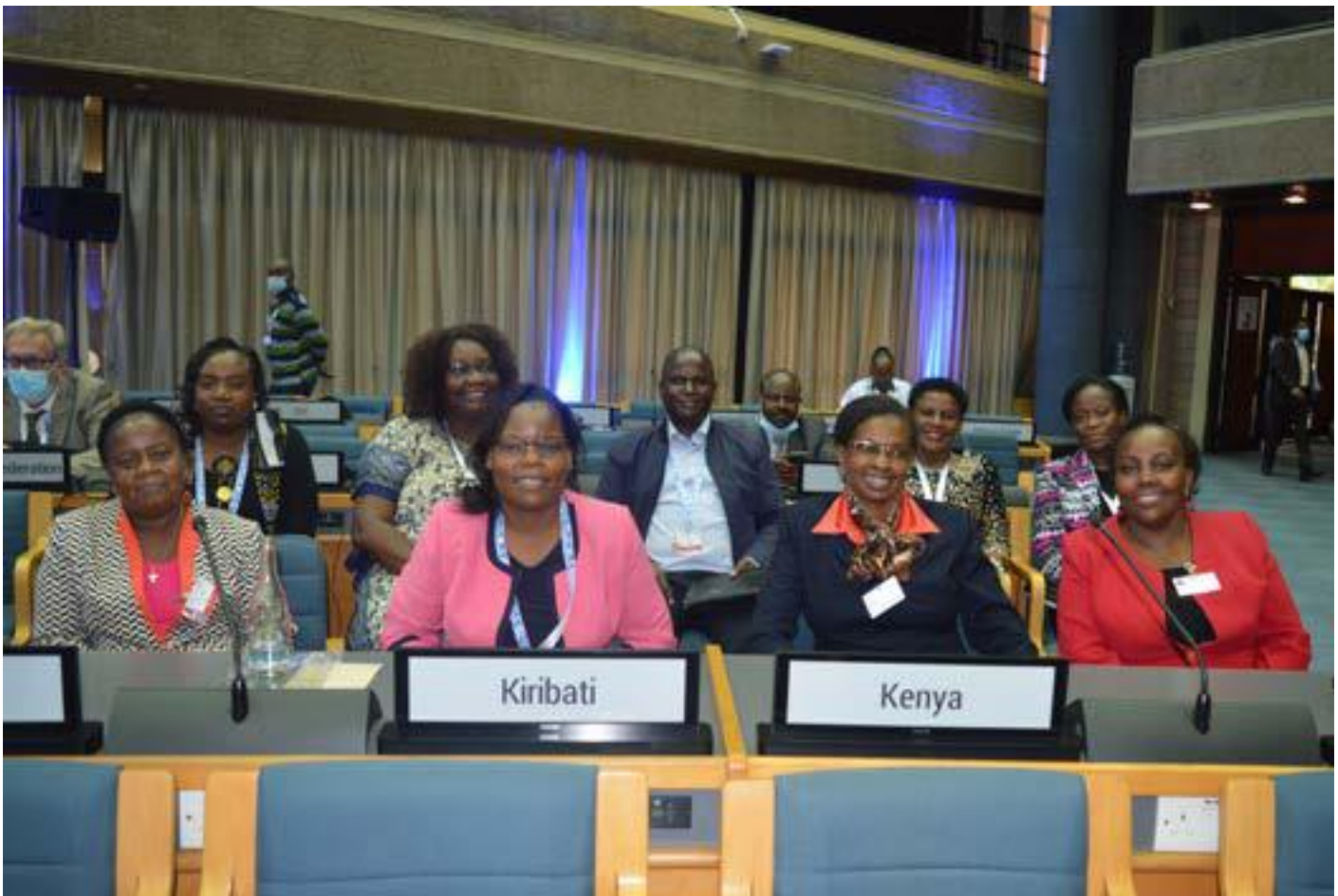
NEMA officers, participants during UNEA 5.2 at UNEP, Nairobi

Given the 93% success rate of the single-use plastic bag ban by NEMA Kenya, more progress was made as world leaders in Nairobi endorsed a landmark agreement to end plastic pollution in the next two years. The heads of state and environmentalists from 175 countries made the historic resolution at the UN Environment Assembly in Nairobi to end plastic pollution, and forge an international legally binding agreement, by the end of 2024