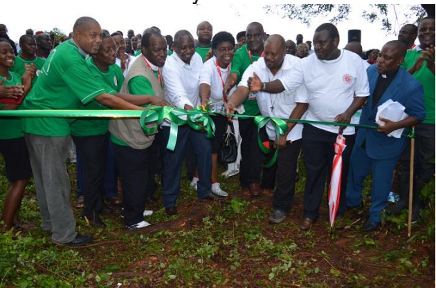
NEMA DG Prof. Geoffrey Wahungu with other dignitaries launching the tree planting exercise at Shanzu TTC in Mombasa

he Kenya Conference of Catholic Bishops (KCCP) launched a tree planting campaign on 25th October 2018 at Shanzu Teachers Training College, in Mombasa County.