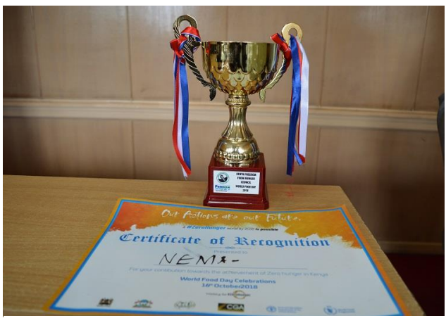
The trophy that NEMA won

was on issues of water harvesting for domestic and agricultural use.