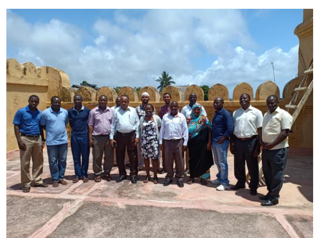
Participants during the workshop in Lamu

In this regard, the consortium of experts implementing the project led by Dr, Charles Lange mounted a stakeholder validation workshop at Lamu Museums on 16th October 2018 to mainly sensitize stakeholder at Lamu about the project, share the project progress and receive feedback or inputs on the project from stakeholders.