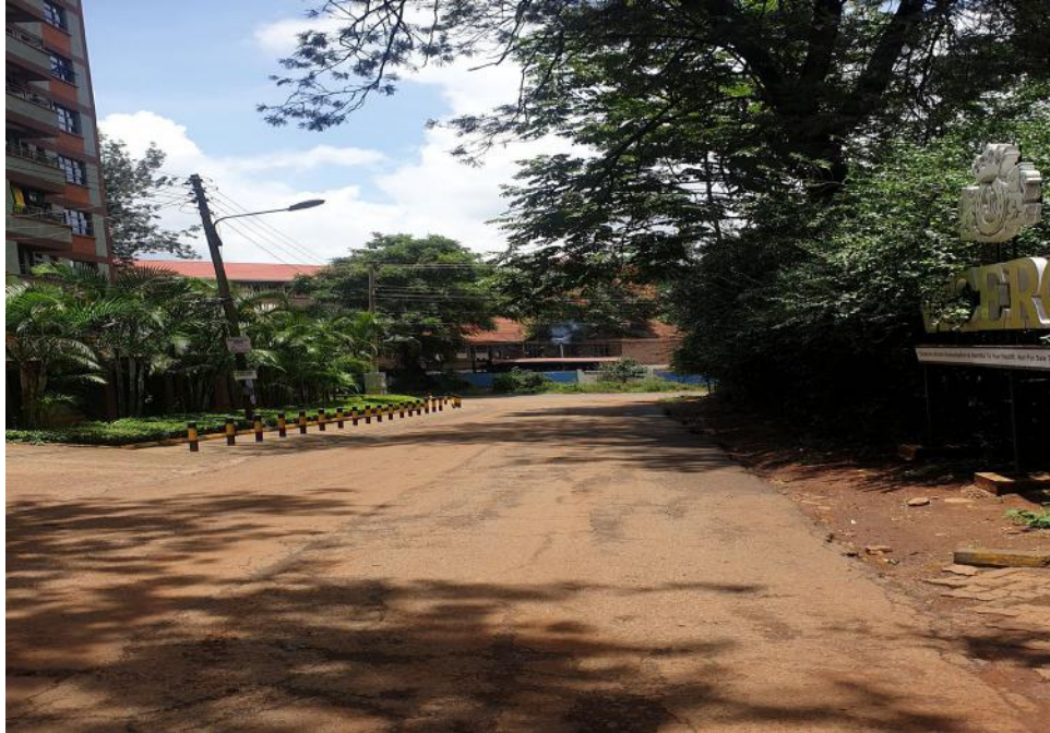
Photo 7: Showing Kolobot Road along which the proposed site is located. The site will be accessed using this road.

The proposed site is located along Kolobot Road in Ngara, Nairobi County. Alternatively, the proponent can access the site via Mpaka Road that connects to Kolobot Road that can easily connect to the site.