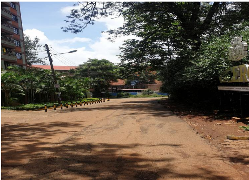
Photo 3: Showing site accessibility along Kolobot Road, Ngara area.

The proposed site is located along Kolobot Road in Ngara Area. The proponent will use the same road to access the proposed site.