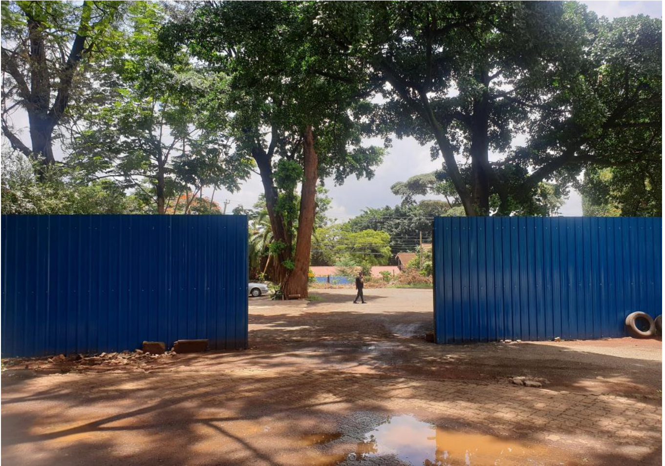
Photo 1: Showing the entrance into the site. This will be the main access into the property.

Construction materials being used are stones, cement, timber, tiles, and paints, steel among other modern materials. There will be generation of waste materials during construction of the project. The proponent is advised to landscape the proposed development on completion so as to enhance its aesthetics value and ensure its sustainability. Also, the proponent will use the existing communication networks and the existing road networks in the area.