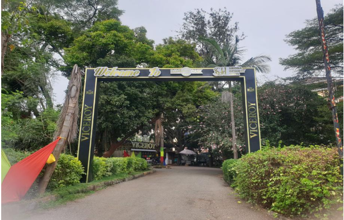
Photo 5: Showing Bamboo Cask Lounge, a Bar and Restaurant located just beside the proposed project site.