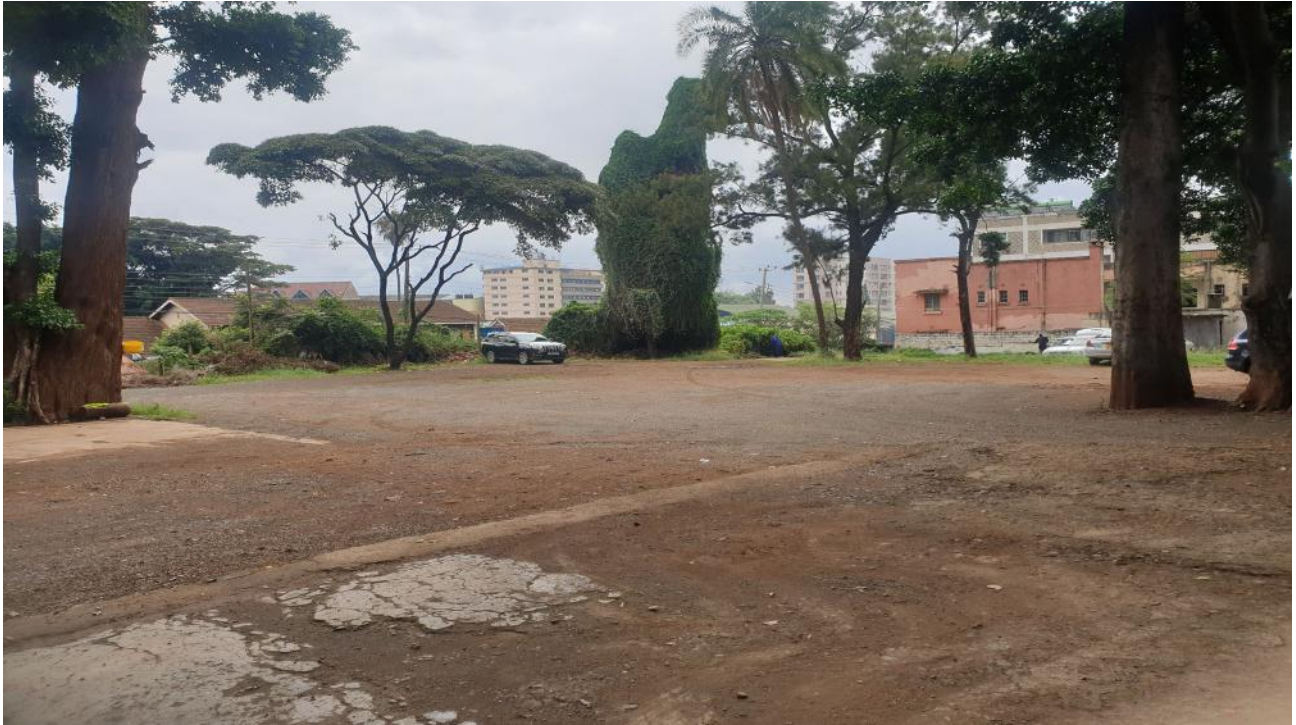
PROPOSED PROJECT SITE

KOLOBOT HOLDINGS LIMITED P.O BOX 11416-00100 NAIROBI