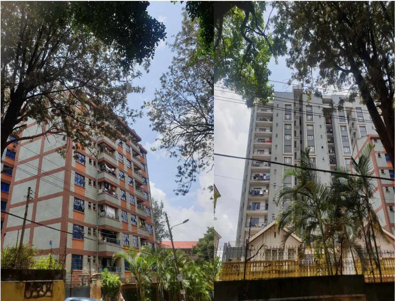
Photo 2: Showing similar project designs in magnitude just next to the proposed project.

The proposed project will be developed on Plot No. NAIROBI/ BLOCK 38/655 located along Kolobot Road in Ngara Area, Starehe Sub County, Nairobi County. The Proposed Site lies on Coordinates Latitude: -1.2704 S and Longitude: 36.8179 E. The general area is characterized by apartments, schools, and other commercial set-up. This therefore means that the proposed project is in character with the developed and ongoing developments of apartments in Ngara Area.