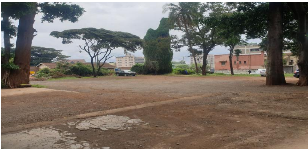
Photo 4: Showing the proposed site with some indigenous trees that will be cleared to pave way for the proposed project.

Communities in these rivers comprise of Producers mainly; autotrophic phytoplanktons and higher Plants (macrophytes), macro-consumers such as zooplankton, Macro invertebrates like the Oligochaetes, and leeches are common highly polluted Rivers like these of Nairobi. Also present are frogs and micro-consumers chiefly bacteria, fungi, which are responsible for the degradation of the particulate or dissolved organic substances by autotrophic processes or coming from allocthonous sources.