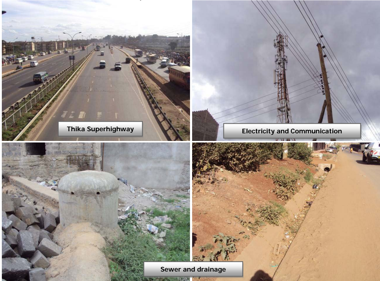
Plate 1: Part of infrastructural development in the area

The immediate access road is off Kamiti Road that is tarmacked and well connected to other roads including Lumumba Drive and therefore the site is well accessible.