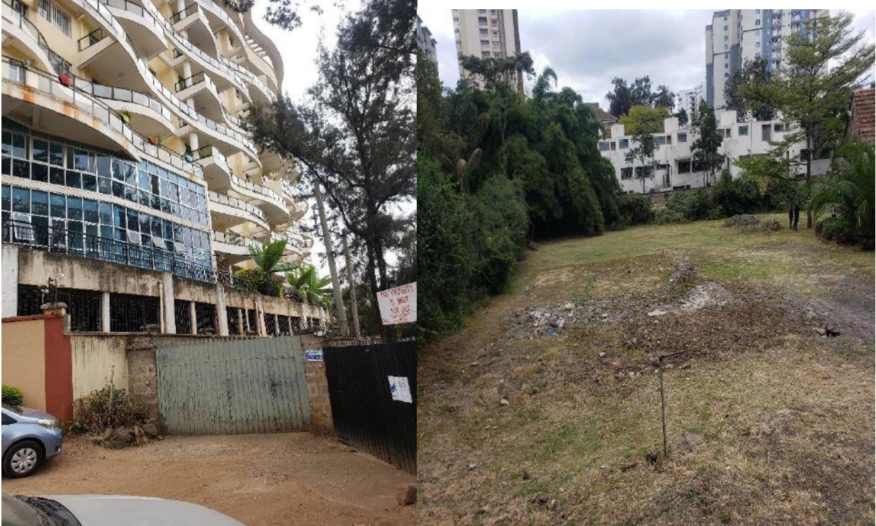
Figure 1. Proposed project Neighbourhood and project site respectively

The proponent owns the parcel of land Plot LR No. 19/255 , along George Padmore road, Kilimani, Nairobi County . The proposed project is located on coordinates( 1^{\circ}17'43''S 36^{\circ}47'36''E ) as shown by the pin drop in the Figure 2 below. The proposed project is in line with the zoning of the area and the project neighbourhood comprises of multi-dwelling units.