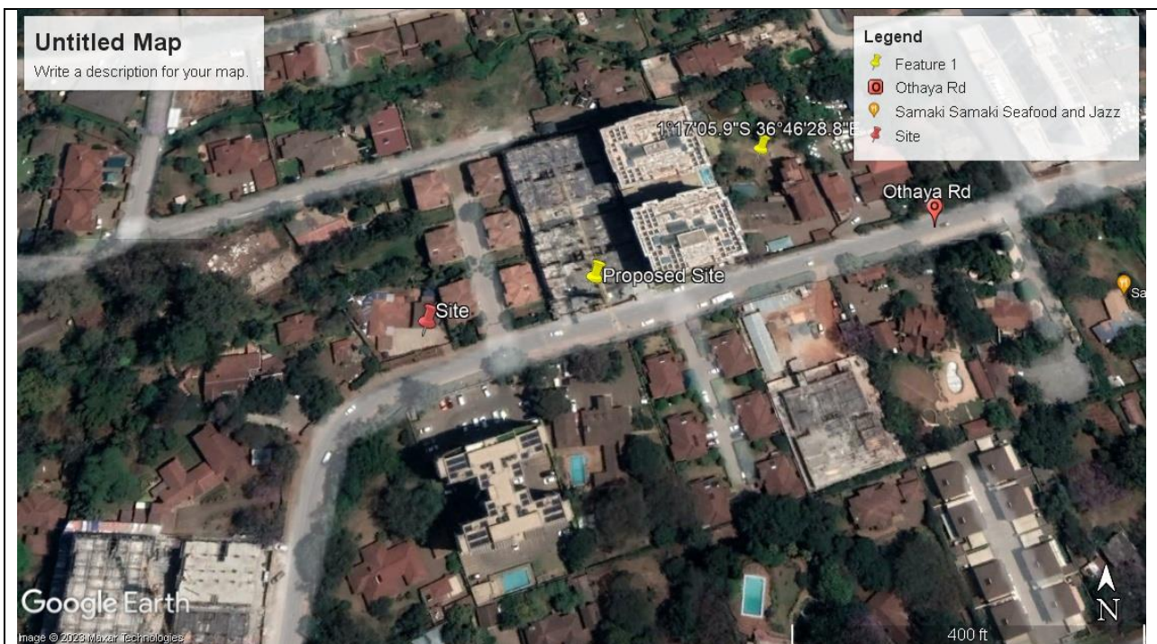
Figure 2: Google location