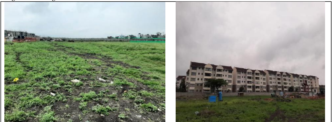
Figure 2. Project site and project neighbour respectively