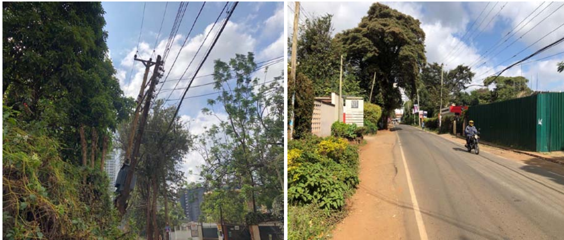
Plate 1: Part of infrastructure in the area

The immediate access road is tarmacked and well connected to other roads and therefore the site is well accessible.