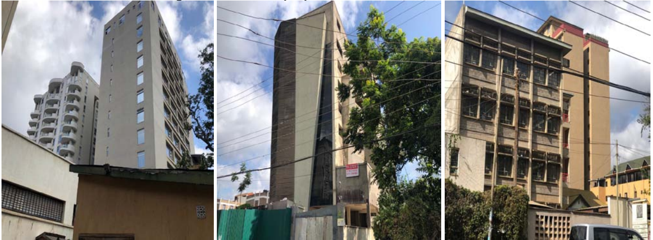
Plate 2: Structures in the neighborhood of the proposed site

The area is well covered by all communication facilities such as landline and mobile services. All these will facilitate communication throughout the project cycle.