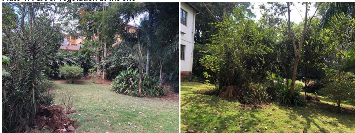
Plate 1: Part of vegetation at the site

There is no fauna/wildlife threatened by the development.