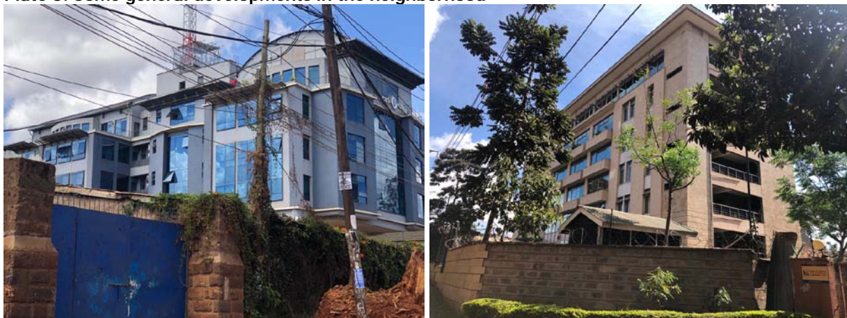
Plate 3: Some general developments in the neighborhood

The proposed project site is Plot L.R. NO. 1870/VI/110 off Waiyaki Way, Westlands area, Nairobi County. From the proposed designs, the essential set local standards (in terms of physical planning, minimum habitable rooms, basic facilities, health and safety) have been met. The land is registered in the name of the proponent. (Please find the attached ownership documents). Similar high rise developments have been implemented in the general neighborhoods and others are developed with town houses.