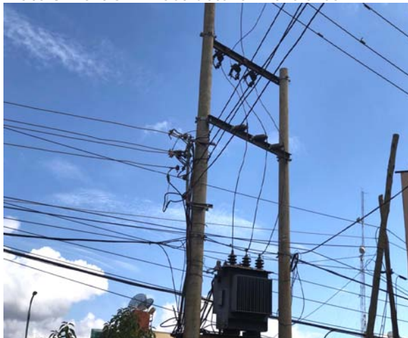
Plate 3: Part of infrastructure in the area

The immediate access road is semi tarmacked and well connected to other roads and therefore the site is well accessible.