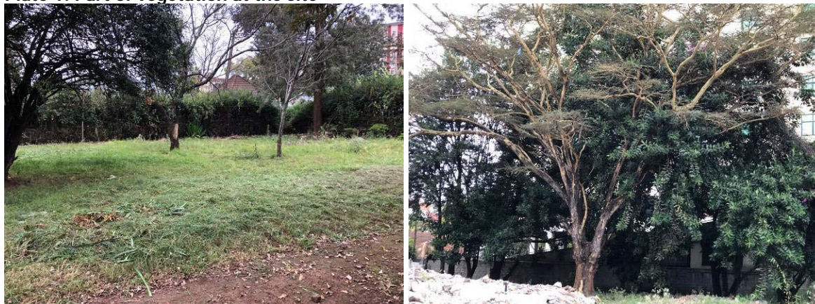
Plate 1: Part of vegetation at the site

There is no fauna/wildlife threatened by the development.