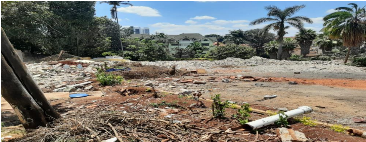
Figure 1. Proposed project site

Symphony Residences Limited owns the piece of land LR 330/1287, along Riara road, Nairobi County on coordinates (-1.297333, 36.763179). Most neighbouring plots to the development have been developed into high rise residential apartments. The surrounding area is highly developed with high-rise developments such as, Cedar Springs Apartments, Junction gardens among other residential developments.