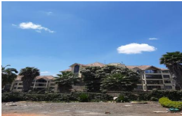
Figure 2. project neighbours