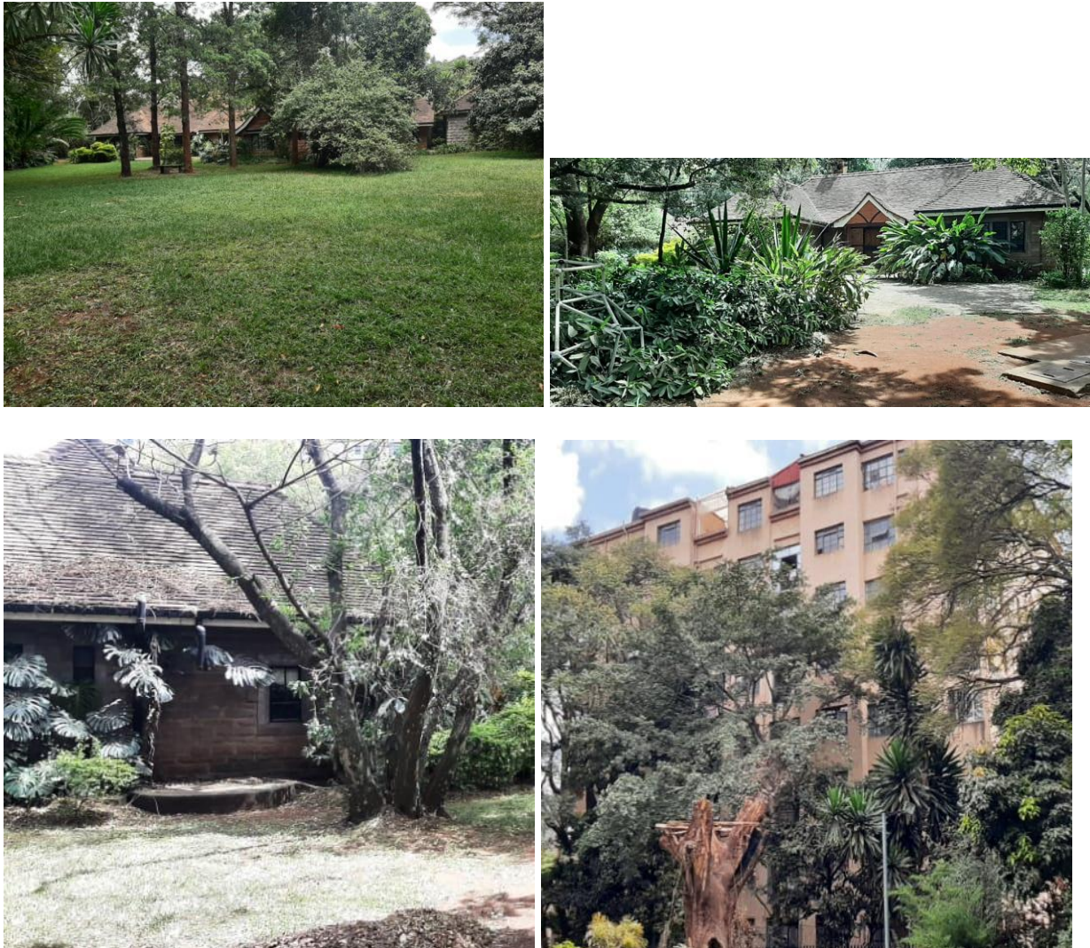
Figure 1: the proposed project site

Walley Company Limited owns the piece of land LR 330/296, along Mararo road, off Gitanga Road, Lavington, Nairobi County on coordinates (-1.292242, 36.773025) as shown by the pin drop in the Figure below. The development proponent has obtained a change of use to enable them put up the multi dwelling (apartments) on land that was previously for single dwelling residential use. Most neighbouring plots to the development have been developed into high rise residential apartments and offices. The surrounding area is highly developed with high-rise developments such as Bric apartments, Valley Arcade Towers, Melody Gardens apartments, Blackstone apartments and several other residential apartments.