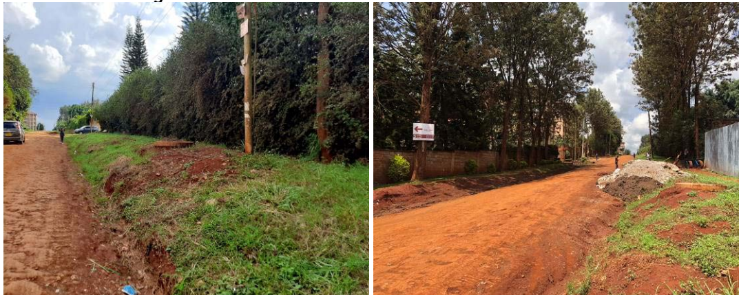
Plate 1: Part of vegetation and soil in the area

There is no fauna/wildlife threatened by the development.