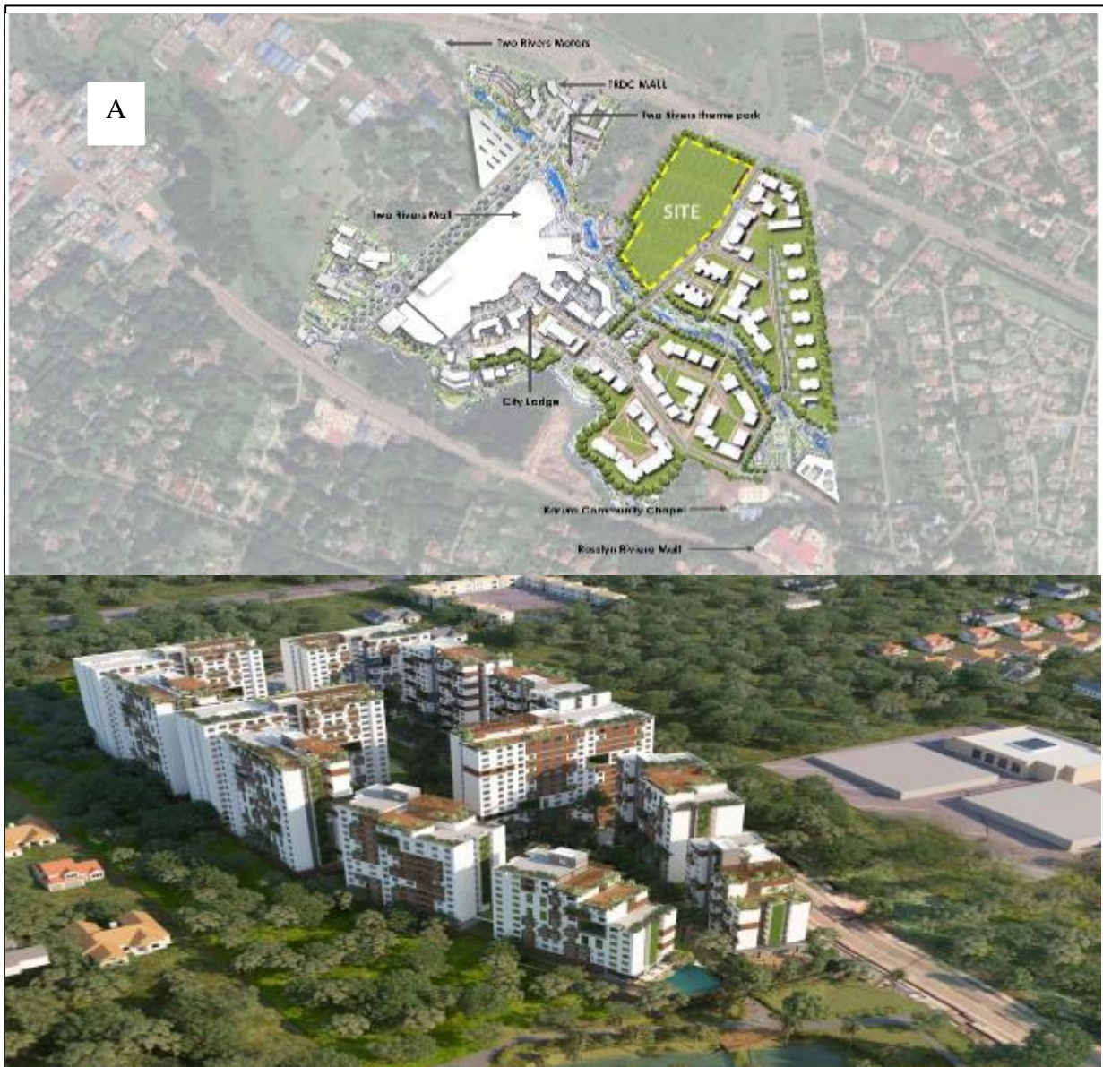
Plate 1: A- project area of influence; B- Artistic impression of proposed project

Construction power will be from the Kenya Power and Lighting Company (KPLC). The project will utilize permanent power from Two Rivers. The various components of the electrical system shall comprise single and twin socket outlet, lockable meter board with glass view panel, gate lights and security alarm panel outlet and CCTV connection system. The relevant guidelines and precautionary measures relating to the use of electricity shall be adhered to.