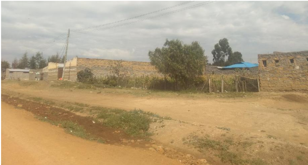
Figure 2: Tishash Estate in Gilgil

Land is the main source of livelihood for many people in Nakuru County. All socio-economic activities depend largely on land hence, rights of land ownership and land use are critical in influencing growth in all sectors.