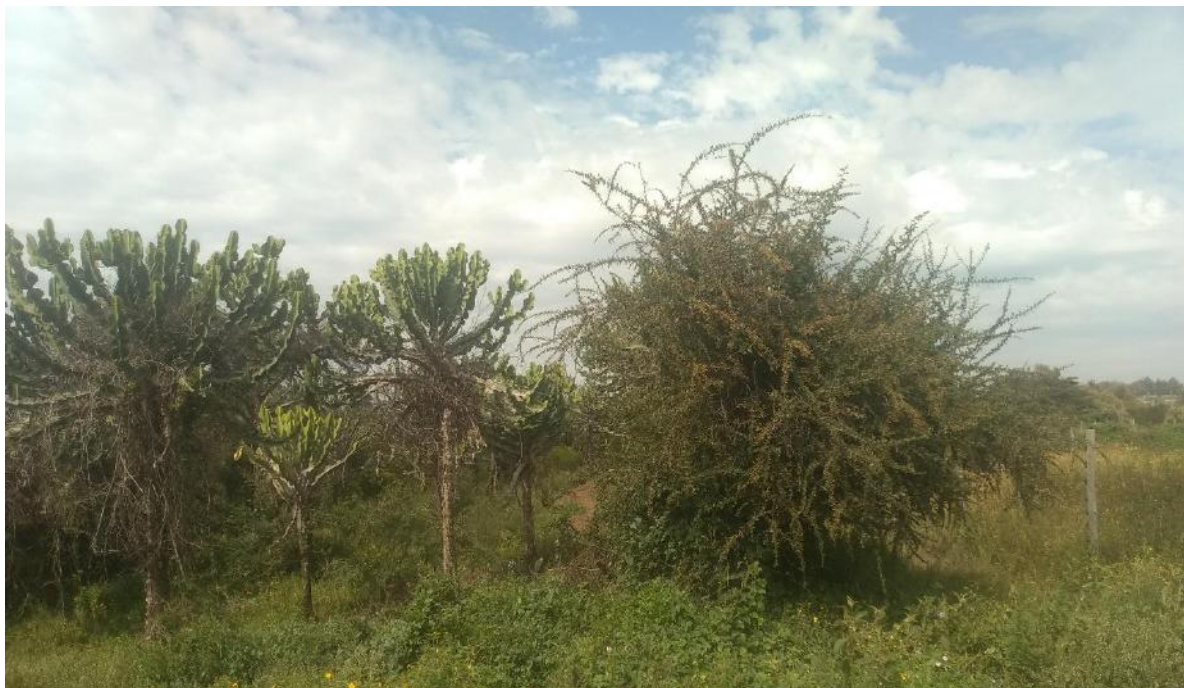
Figure 1: Plant species

The proposed site has sparsely distributed indigenous tree species though the area is largely dominated by green houses and other farms. The tree species are not under the International Union of Conservancy of Nature (IUCN) as threatened or endangered. Some of the tree species notable in the proposed project site was the Euphobia candelabrum .