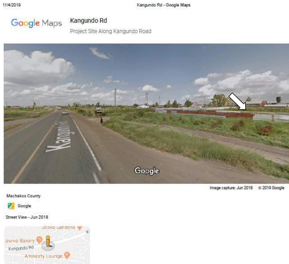
Plate 3.1: Project Location

The proposed project as earlier discussed, involves the construction of a mixed use development on Plot L. R. No. Donyo Sabuk/Komarock/ Block 1/ 89438.