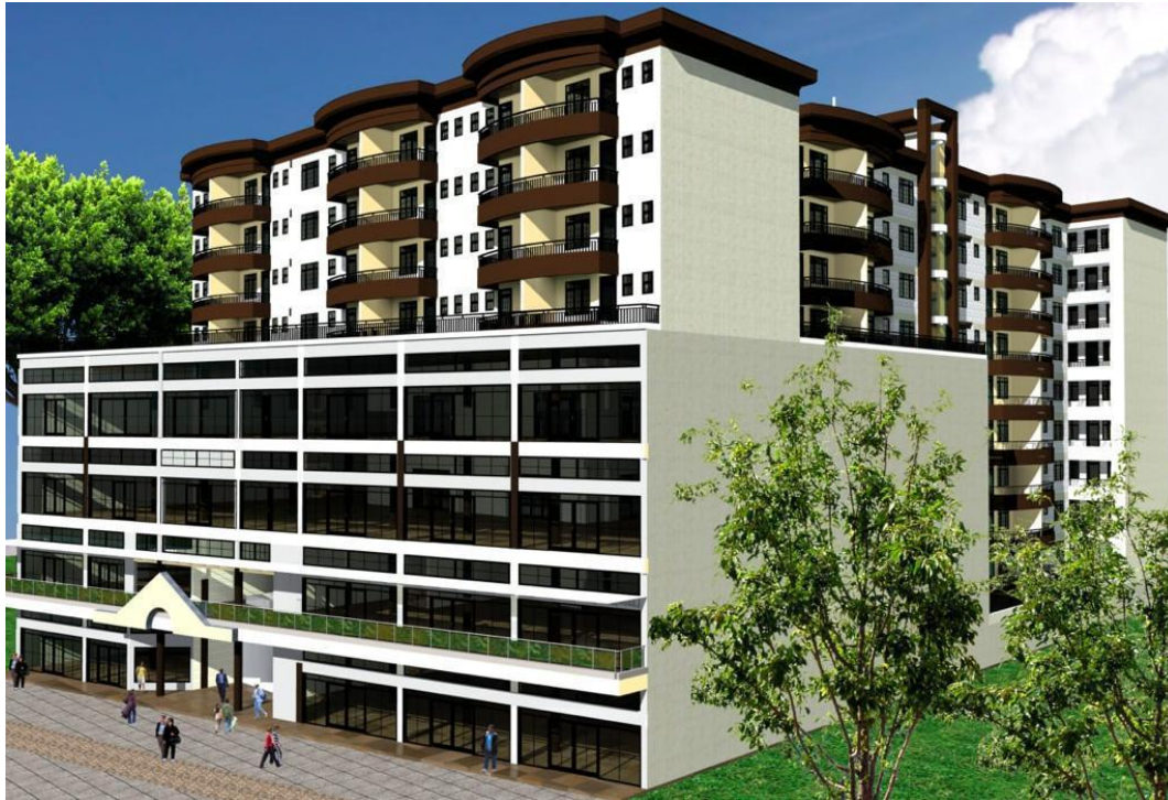
Plate 1-1: Architectural Impression of proposed project