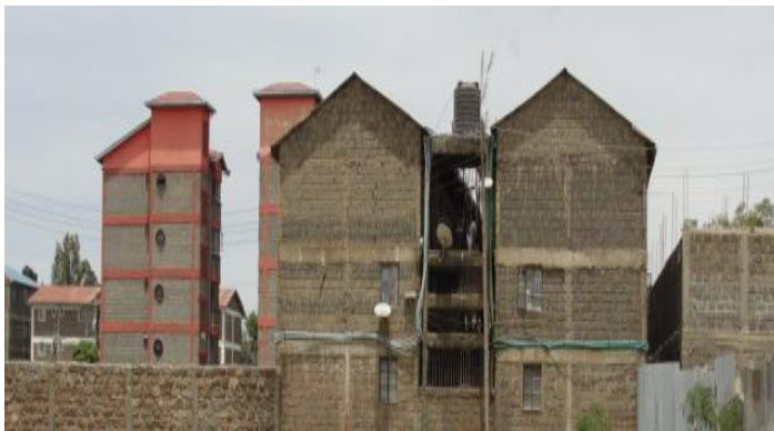
Neighbouring residential property under construction

Average, daily temperature varies from 17° C in July/August, to 28° C in March. The maximum daily range of temperature is quite large 10 ° C to 30 ° C in May and February respectively.