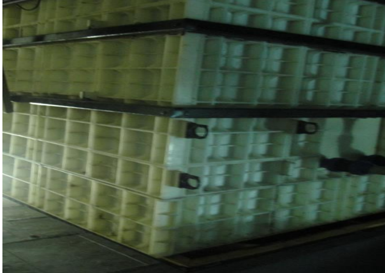
Inbuilt Sewerage septic tank in Mombasa at English point Marina

Each residential unit is connected by 150 mm diameter pipe which will connect to the biological septic tank. The waste is taken a process that the gases help stir the sludge, scum and liquid layer which promotes digestion of solids. Digestion takes place both aerobically and an-aerobically. Kings Serenity will have a similar Sewerage treatment plant found in below;