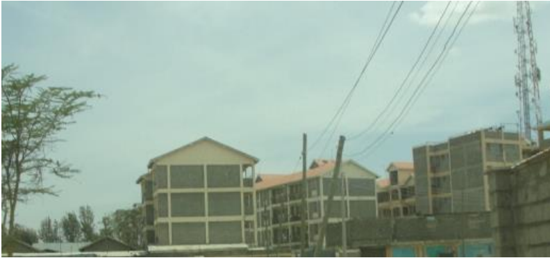
Power line to the proposed project area.