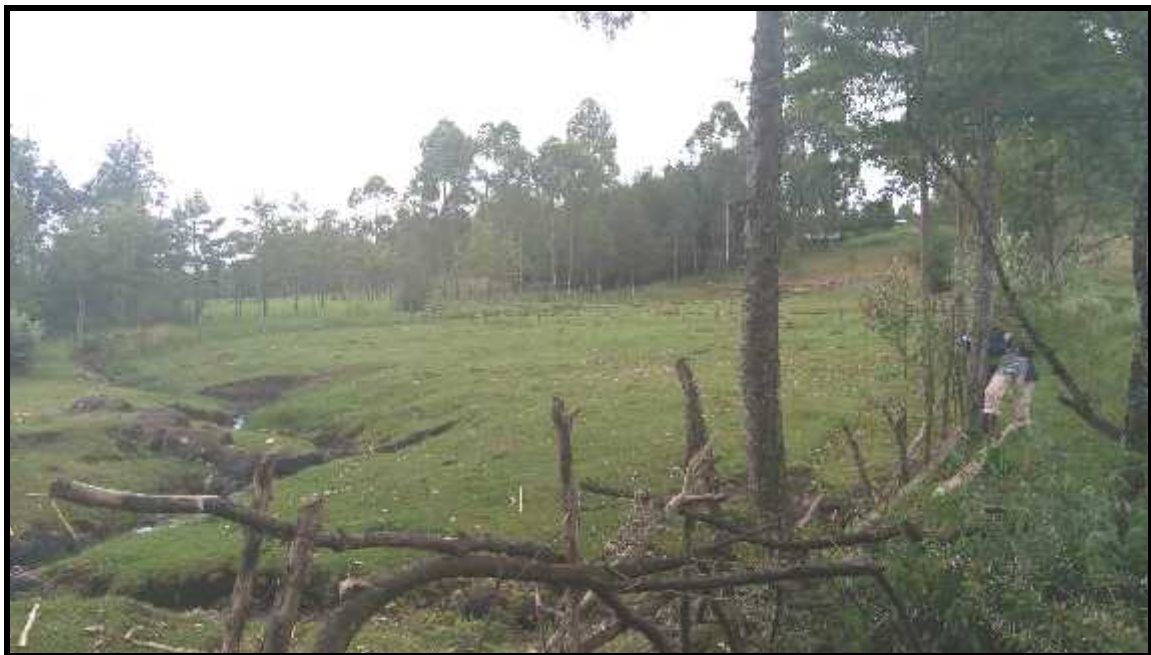
Area downstream of proposed dam that is prone to flooding during rainy season