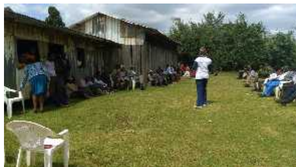
Plate 2: An EIA team member addressing the Public Baraza