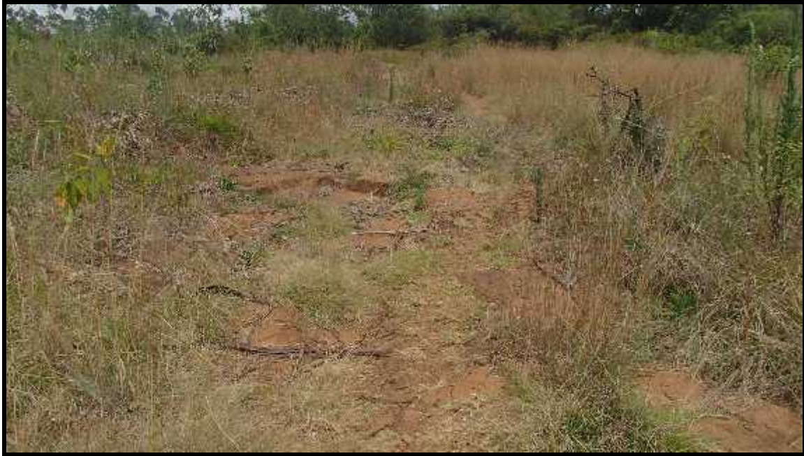
Ground Condition at the Proposed Site