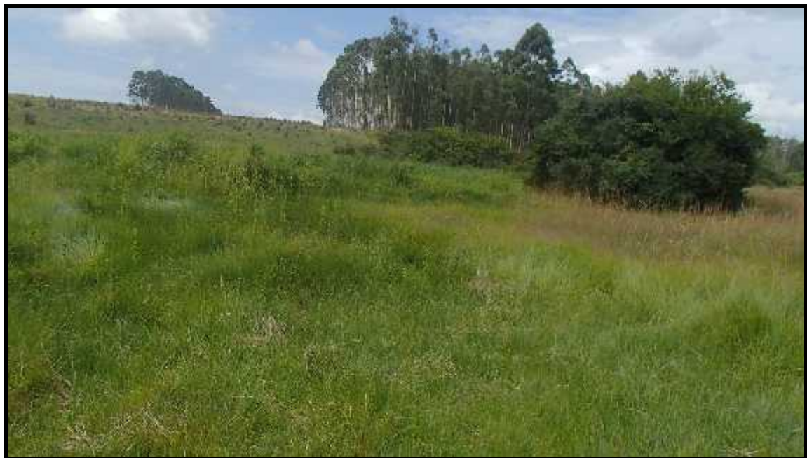
Vegetation at the Proposed Site for Kipsirchet Dam