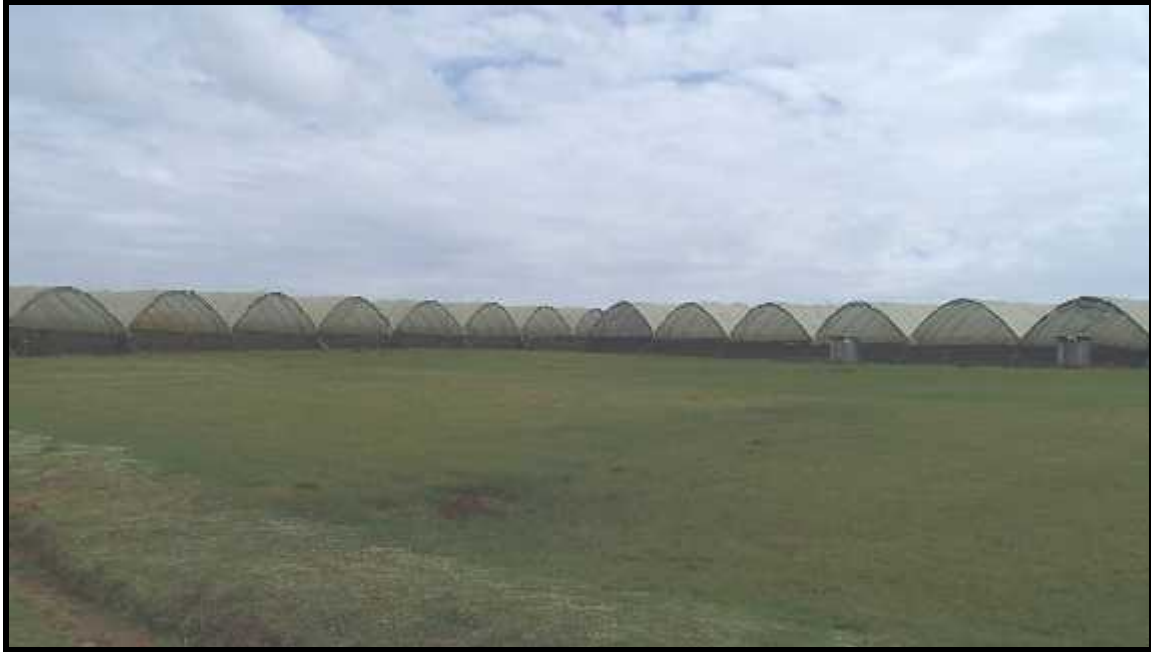
Some of the Greenhouses at Lemotit Farm