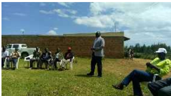
Plate 1: The Area MCA Addressing the Public Baraza

The EIA team further held a public meeting with downstream area residents at Nairobi Shopping Centre in Lemotit Location on 15 th December 2017. See attached list of attendants and minutes of public consultation meetings in Appendix B .