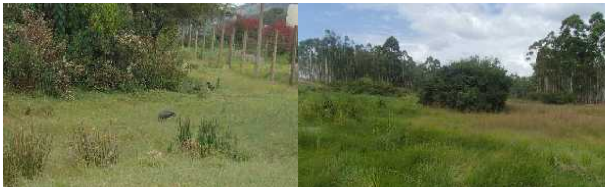
Vegetation cover around the proposed dam site

The animal species in the area include birds, hares, ant eater, rats, snakes and frogs.