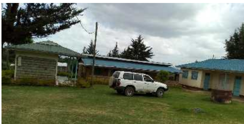
Figure 2: Lemotit Dispensary

The Project area is served by two health facilities namely; Lemotit Dispensary and James Finlays Dispensary: Lemotit Dispensary is a public health facility while James Finlays Dispensary was constructed within Lemotit Farm for offer medical services to the workers and their families. However, the facility can also serve the general public.