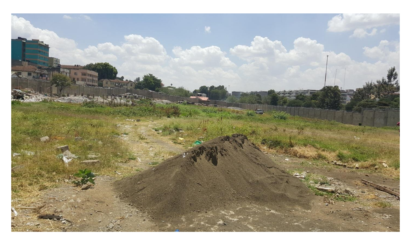
The proposed site