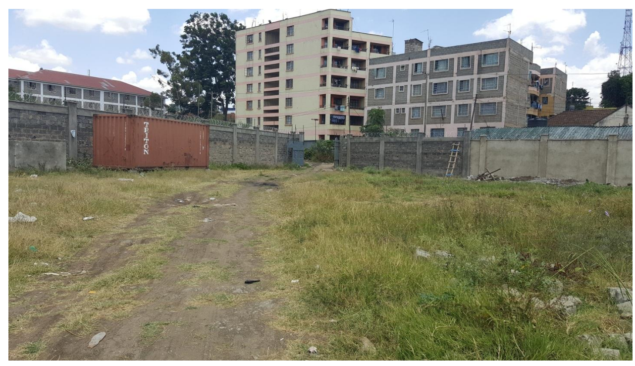
Residential flats near the site