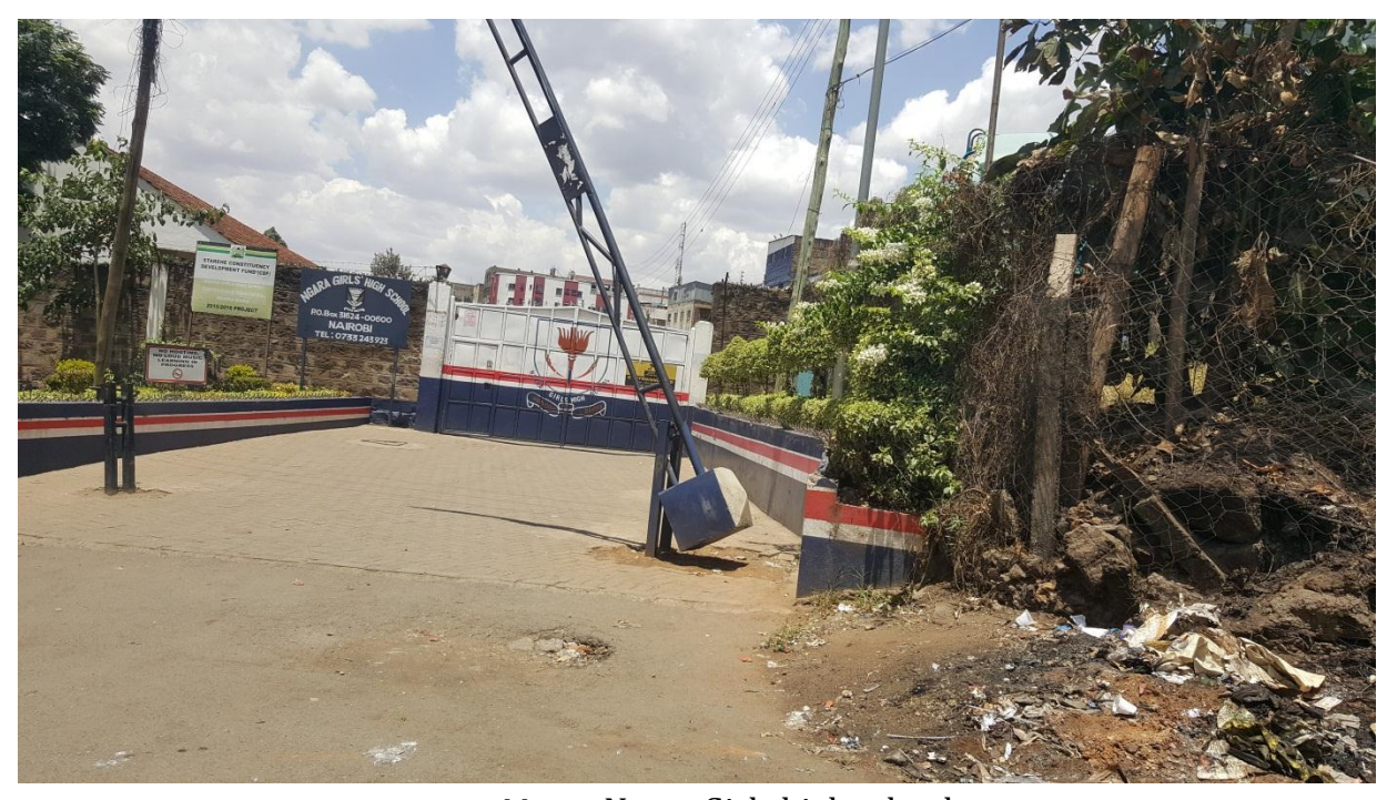
Naighbour; Ngara Girls high school

The proposed location is shown in the pictures below. The co-ordinates of the project sites geographical area are (-1.2783799 S, 36.82678771 E)