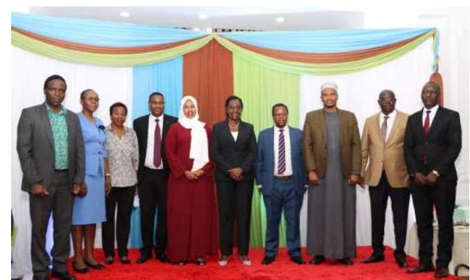
NEMA Board members in a group photo with CS Hon. Soipan Tuya