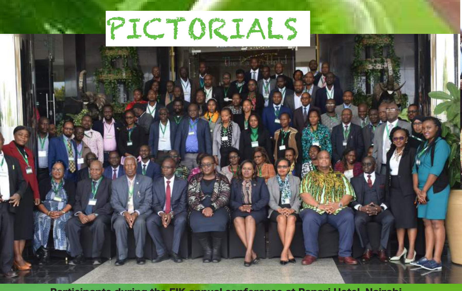
Participants during the EIK annual conference at Panari Hotel, Nairobi