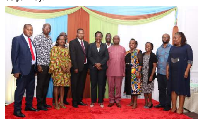
NEMA management team in a group photo with CS Hon. Soipan Tuya