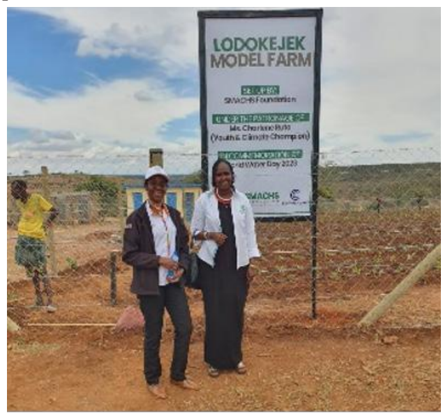
CDE Samburu & RDE-RV & NRB region at the event

NEMA's effort of protecting and conserving the water resources in the country and fragile ecosystems. NEMA policy direction is that all projects listed in the 2nd Schedule to comply with EMCA, 1999 and subsequent regulations and the office will be keen to ensure the project implementation adhere to the provisions.