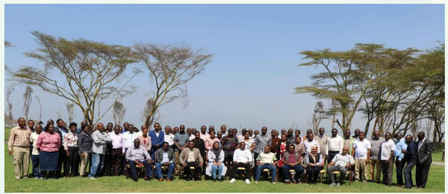
NEMA CDEs, Management and Board Members during a retreat in Naivasha