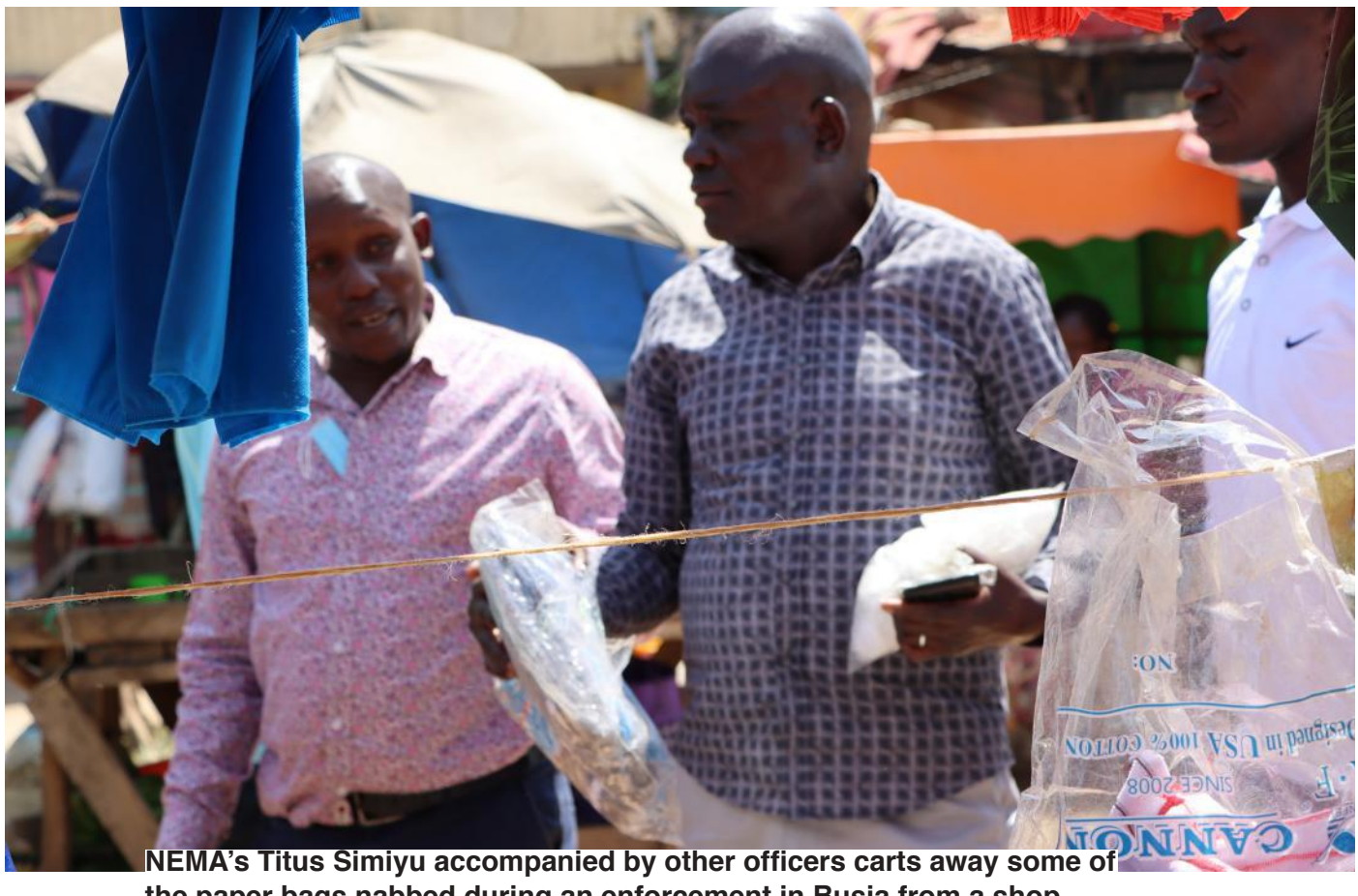
the paper bags nabbed during an enforcement in Busia from a shop.