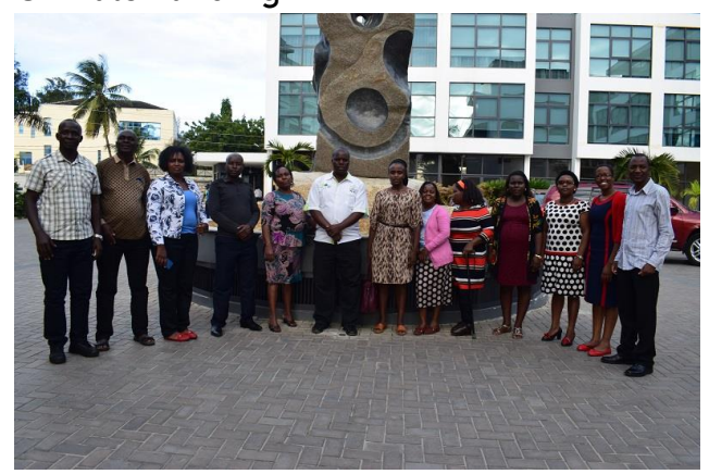
AF/GCF committee members during induction at English Point Hotel, Mombasa

The workshop aimed at inducting the secretariat on the progress of the ongoing Adaptation Fund projects in the 13 Counties in Kenya and the status of Green Climate Funding.