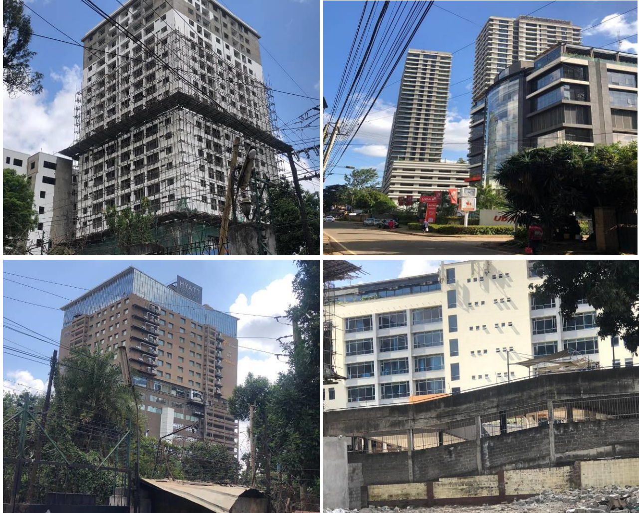
Plate 4: Some general developments in the neighborhood

Similar high-rise developments have been implemented in the general neighborhoods while others are ongoing.