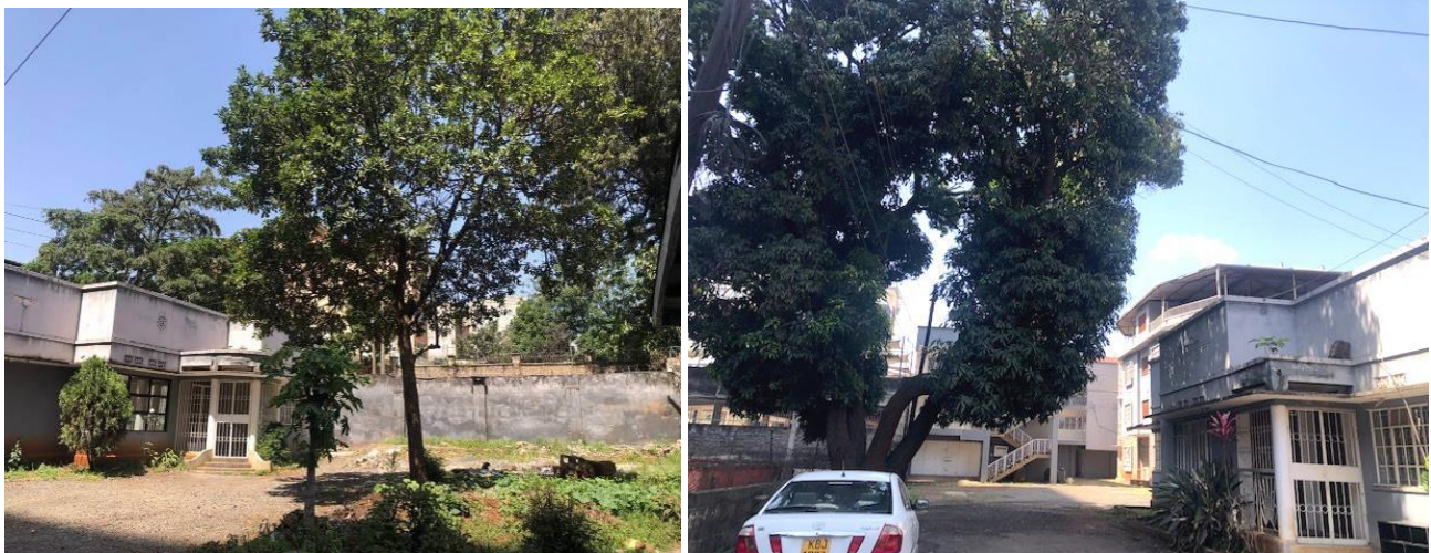
Plate 1: Part of vegetation on the proposed site and along the road

There is no fauna/wildlife threatened by the development except may be rodents and insects.