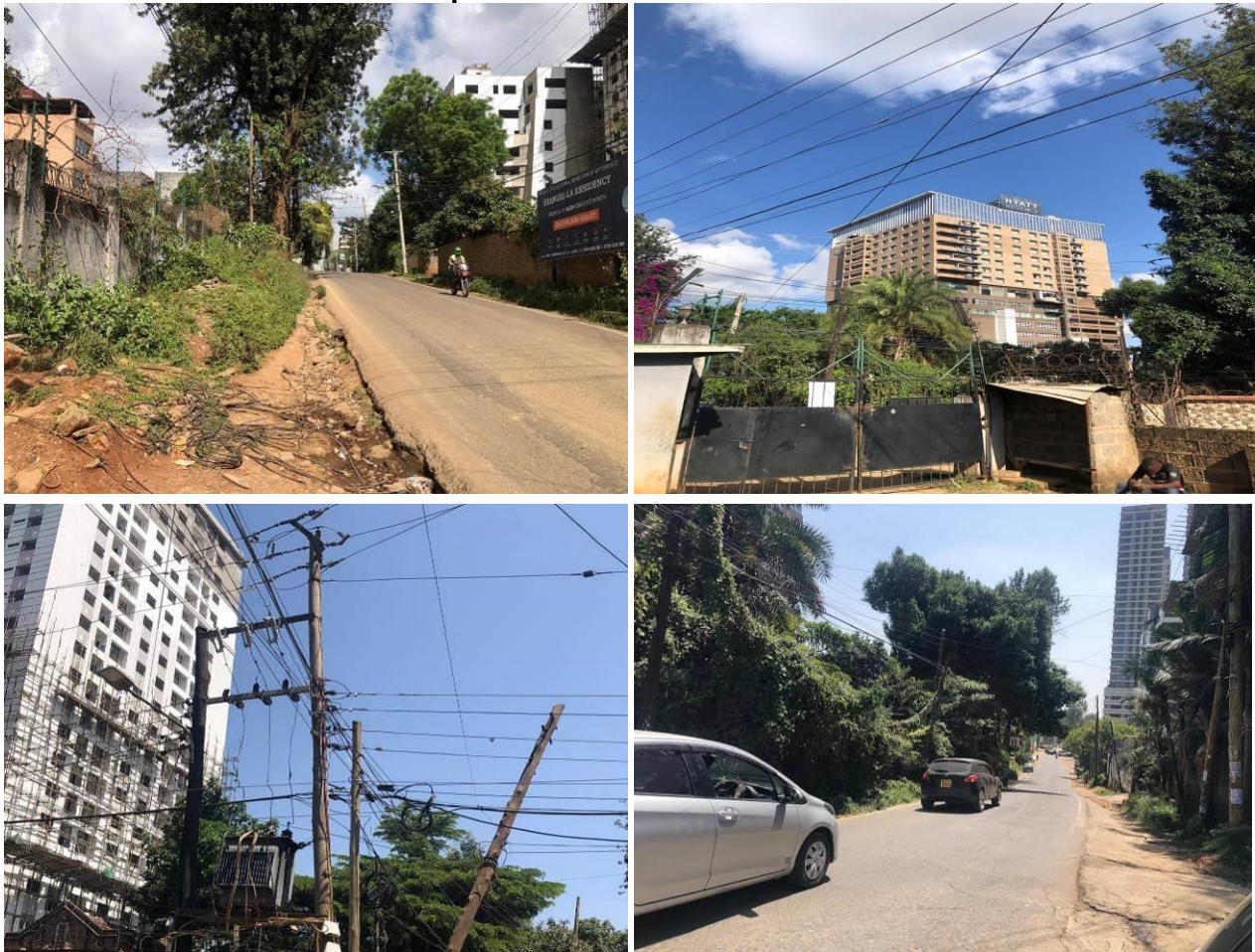
Plate 2: Part of infrastructural development in the area

The immediate access road is Westlands Road that is well connected to other roads.