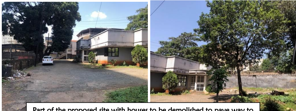
Part of the proposed site with houses to be demolished to pave way to the proposed project

(GPS Coordinates: Latitude -1.267604, Longitude 36.806612)