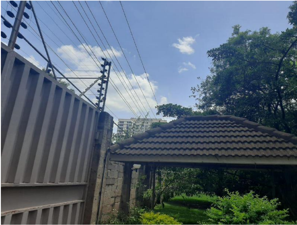
Figure 2: Neighbouring similar development