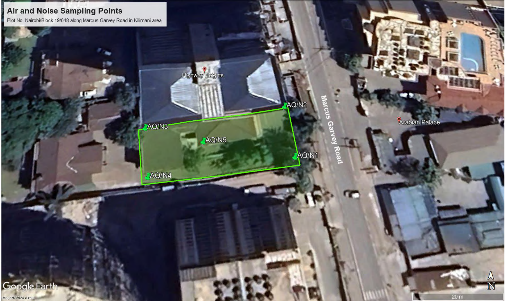
Figure 4. 1: Air and Noise Sampling Points