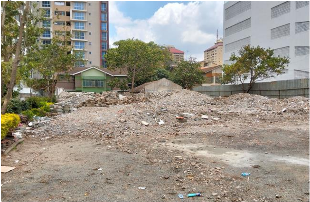
Figure 2. 1: The Site

The proposed project will entail the construction of 195 residential apartments and associated amenities in Kilimani area . The project aims at providing housing infrastructure as well as maximizing the utilization of the property. Currently, the site is characterized by demolition debris that will be transported for reuse in other construction sites.