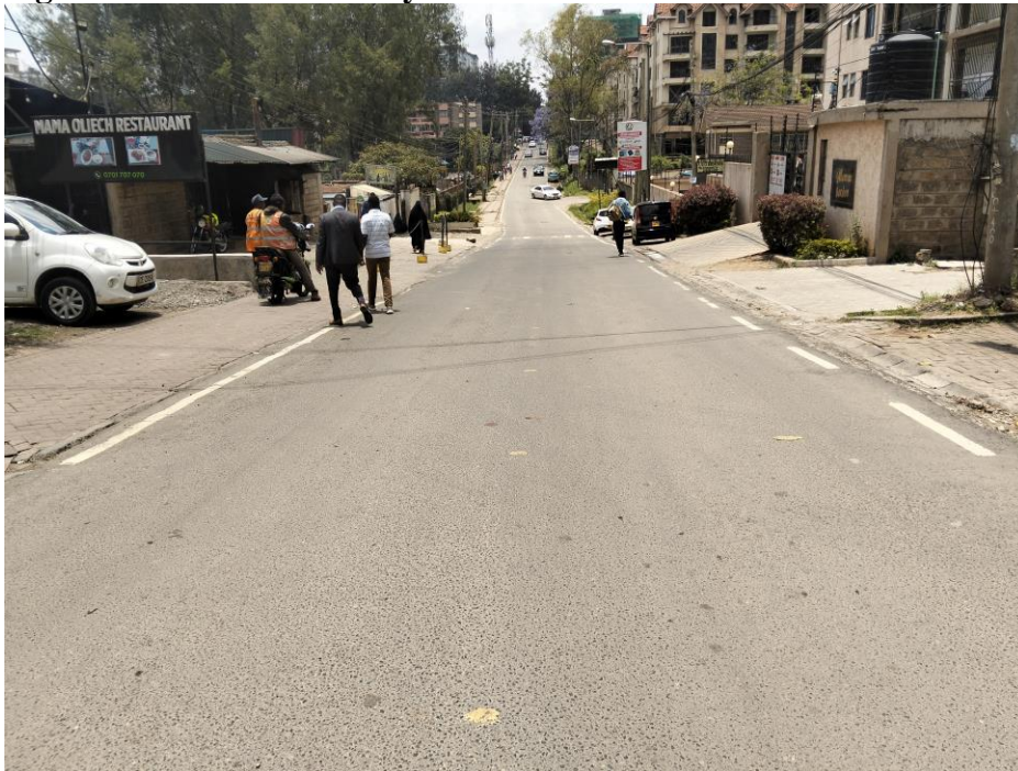
Figure 2. 5: Marcus Garvey Road

The property is located along Marcus Garvey Road in Kilimani area. The access road is tarmacked, in good condition, with street lights and walkways. It connects to Argwings Kodhek Road, Ngong Road, and Ring Road Kilimani linking the area to nodes such as Yaya Centre and Central Business District for socio-economic activities. The accessibility of the site will be instrumental during the project cycle.