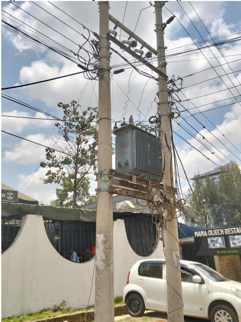
Figure 2. 6: Electricity Transformer along the Access Road

The general area as well as the site is served by electricity from the national grid. During the project cycle, energy will increase as a result of consumption in the running of construction equipment such as air compressors ; running of household equipment such as washing machines, refrigerators, and air conditioners ; and lighting appliances among others. The estimated energy demand during the operation phase will be approximately 1,500KVA . The sources of energy for the proposed development will be from the main grid, generator and solar energy. The proponent will apply for an onsite transformer to supply energy to the development subject to the acquisition of a connection permit from KPLC. The developer will also install solar panels to provide an alternative source of renewable energy and a generator as a backup source of energy for the proposed development.