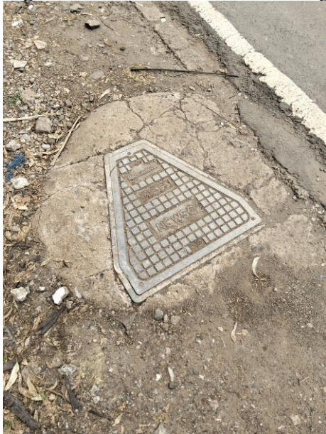
Figure 2. 7: Sewer Manhole along Marcus Garvey Road

The general area as well as the site is served by the NCWSC conventional sewer system. The estimated liquid waste that will be generated during the operation phase will be approximately 65m^3 per day. The proponent shall extend the connection of the proposed development to the existing conventional sewer system upon acquisition of a connection permit from NCWSC. All sanitary works will be done to the satisfaction of the County Government Health Department.