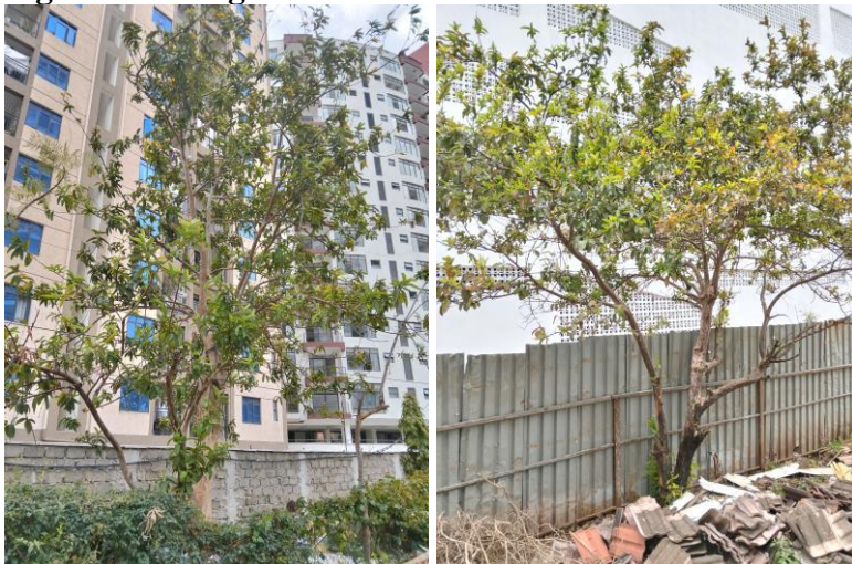
Figure 4. 2: Vegetation within the Site

The area is characterized by small invertebrates such as earthworms, ants, grasshoppers, butterflies and spiders and vertebrates like lizards and birds. No rare, endangered and threatened species or endemic species were present. The impact of the project activities on the biological environment is negligible since the environment is already disturbed and diminished because of the residential activities.