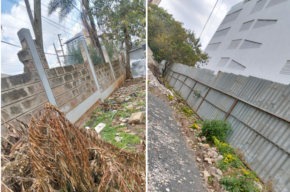
Figure 2. 9: Plot Fencing