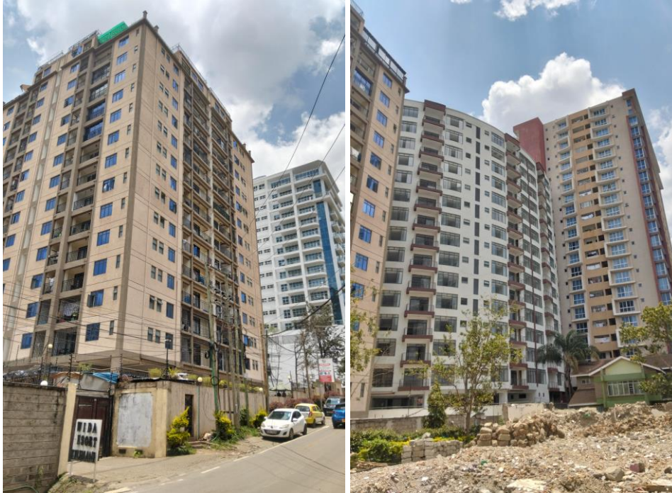
Figure 2. 3: High-Rise Residential Apartments in the Neighbourhood

The property is located in Zone 4 according to Nairobi City Development Ordinances and Zones which allows for Residential Apartments . According to draft Sessional Paper No. 1 of 2023 on Nairobi City County Development Control Policy , the property is in Zone 4D which allows for Residential and Commercial Developments with a skyline of 15 levels . Notable residential developments in the neighbourhood include Ophelia Heights (16 levels) and Marcus Garden (14 levels) . Other land uses within a radius of 250 meters from the project site include Educational (French School) , Offices (Highway Heights and The Priory) , Restaurant (Arabian Place) , and Retail (QuickMark Chaka Road) . Therefore, the proposed development will conform to the current land uses and will ensure better utilization of the property, giving it a higher-quality urban character.