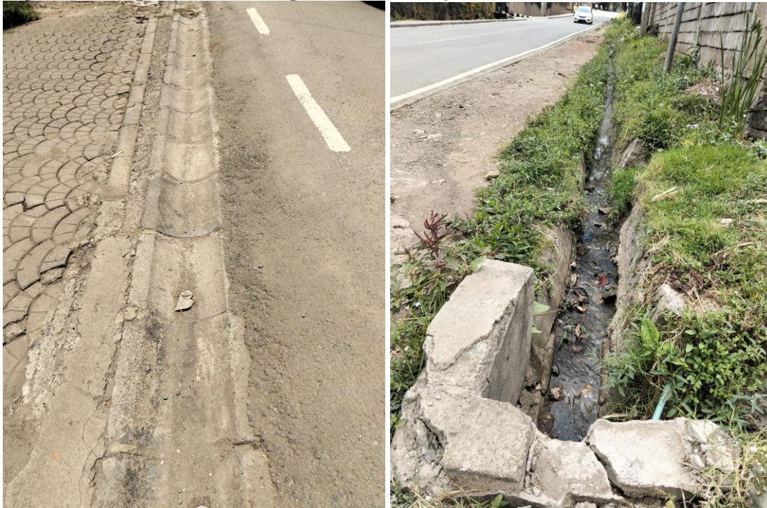
Figure 2. 8: Open Drains along Marcus Garvey Road

Stormwater in the general area is managed by the closed and open drains along the access roads that channel the runoff into the Ngong river tributary . The subject property drains its stormwater through natural infiltration and excess flows into the open drains along the access road. The proponent will construct internal drains for stormwater management within the site.