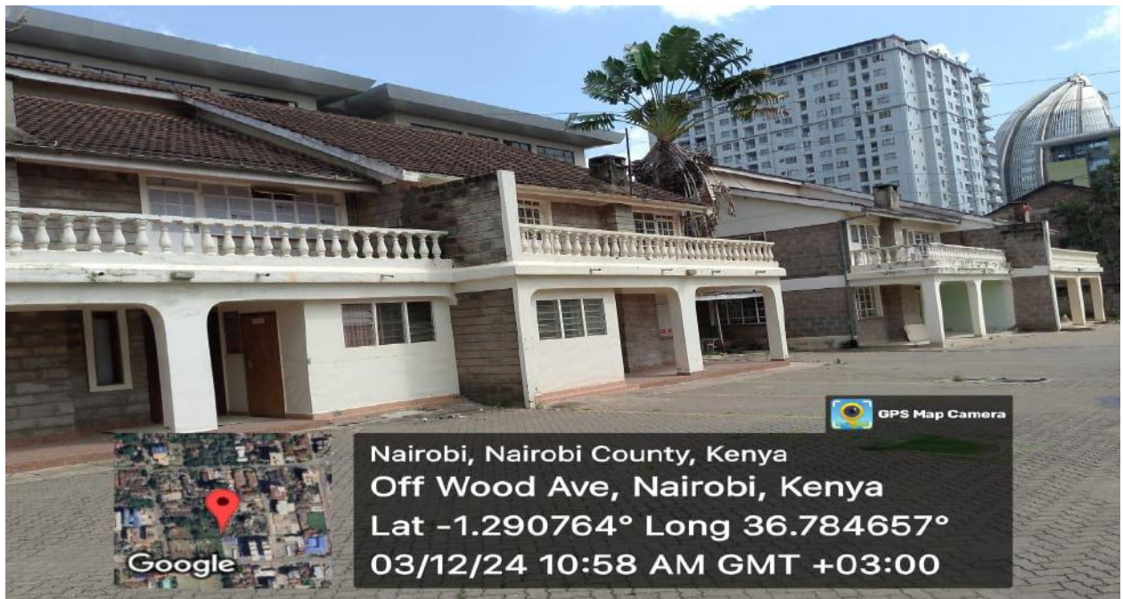
Figure 1. Proposed project site

The proposed project is located on coordinates 1^{\circ}17'26.8''\text{S} 36^{\circ}47'04.8''\text{E} as shown by the pin drop in the Figure 3 below. The proposed project is in line with the zoning of the area and the project neighbours are high rise buildings.