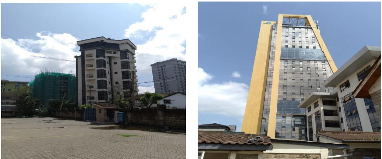
Figure 2: The project neighbourhood developments