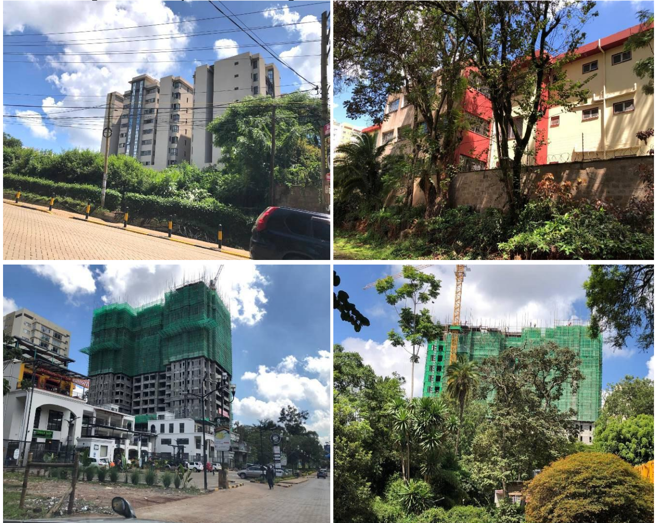
Plate 3: Some general developments in the neighborhood