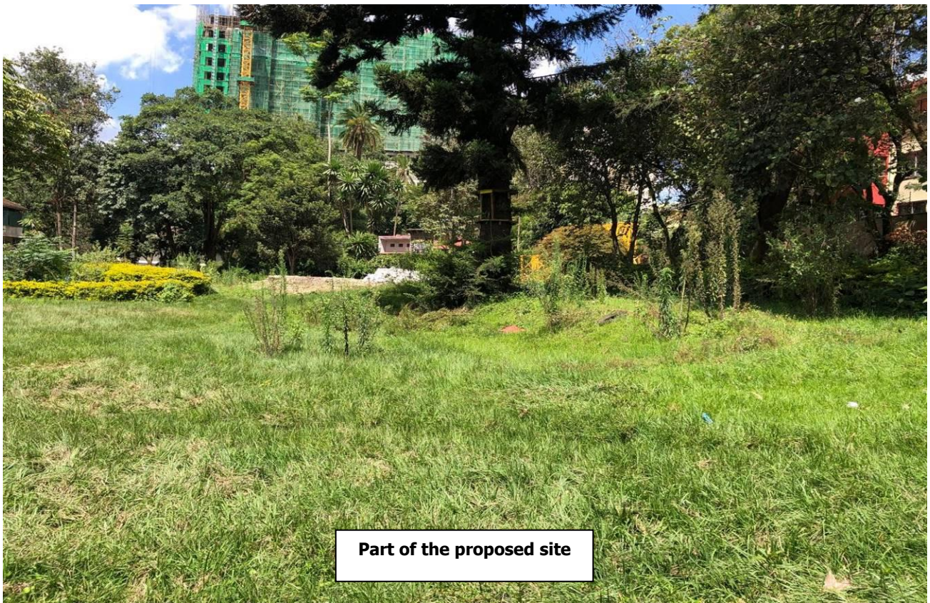
Part of the proposed site

(GPS Coordinates: Latitude -1.255922, Longitude 36.801915)