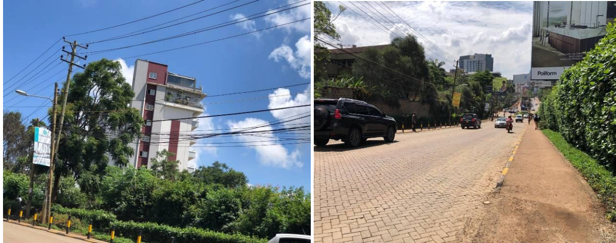
Plate 1: Part of infrastructural development in the area

The immediate access road is Peponi Road that is well connected to other roads.