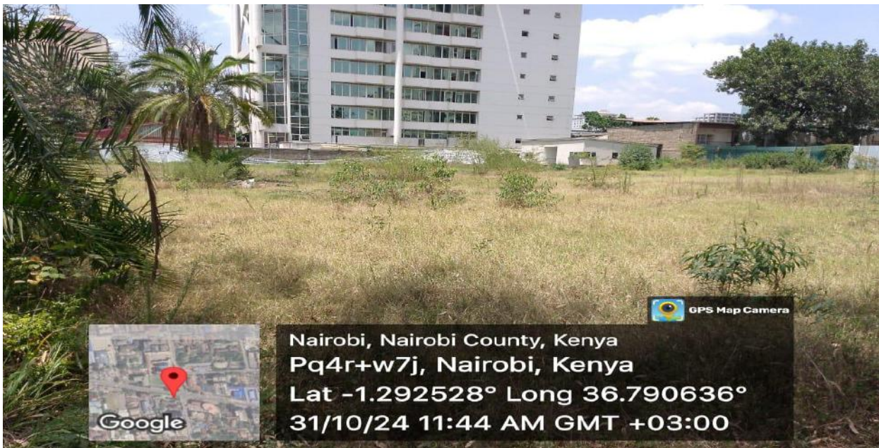
Figure 1. Proposed project site

The proposed office building (Ugatuzi Tower) is located at the junction of Argwings Kodhek and Chaka Road approximately 260m from Yaya Centre and 4km from Nairobi CBD and approximately 2 km from Ngong road. The proposed project will be undertaken on L.R. No. 1/383, measuring 1.294 acres, along Argwings Kodhek road in Hurlingham area, Nairobi County. The surrounding area is highly developed and is dominated by high rise commercial buildings with supermarkets, malls, offices and multi-dwelling residential apartments among others. The project is located on plot coordinates (-1.29272, 36.79052) as shown below.