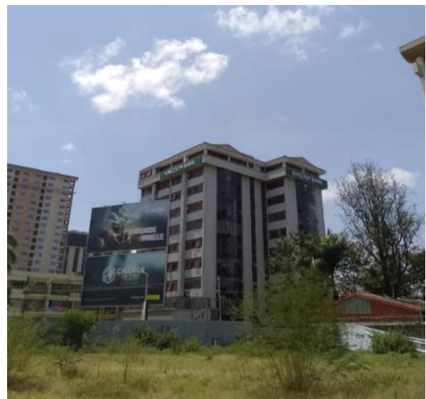
Figure 2: The project neighbourhood characteristics