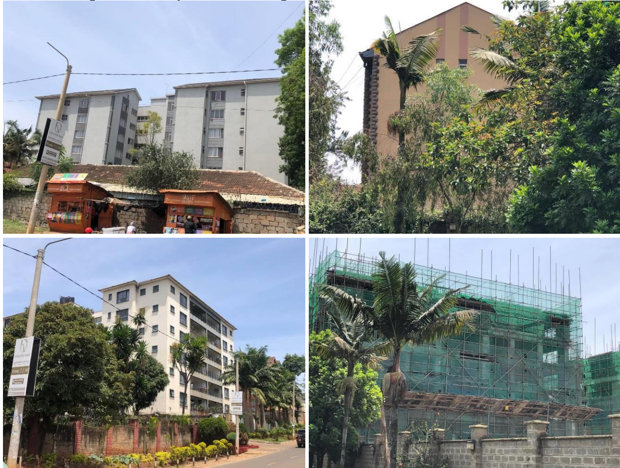
Plate 4: Some general developments in the neighborhood