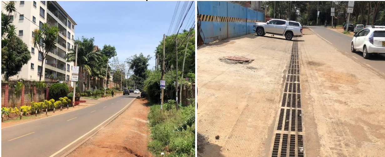
Plate 2: Parts of infrastructural development in the area

The immediate access road is Mvuli Road which is well connected to other roads and therefore the site is well accessible.