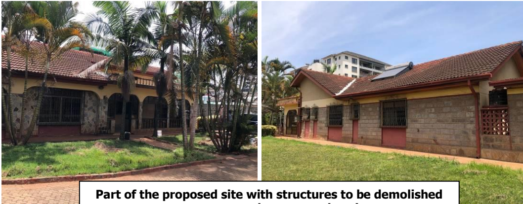
Part of the proposed site with structures to be demolished to pave way to the proposed project

(GPS Coordinates: Latitude -1.264111, Longitude 36.792722)