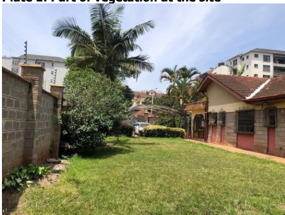
Plate 1: Part of vegetation at the site

There is no fauna/wildlife threatened by the development.