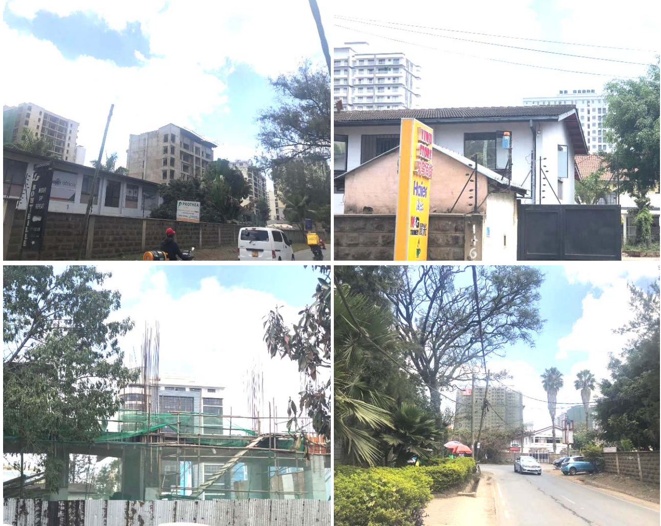
Plate 3: Some general developments in the neighborhood

Similar high-rise developments have been implemented in the general neighborhoods while others are ongoing.