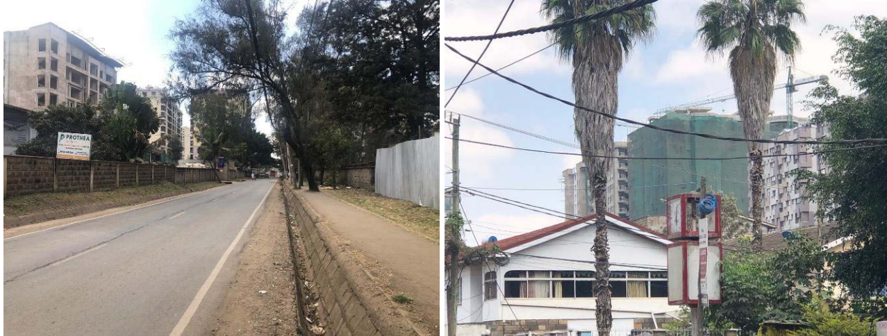
Plate 1: Part of infrastructural development in the area

The immediate access road is Kindaruma Road that is well connected to other roads.