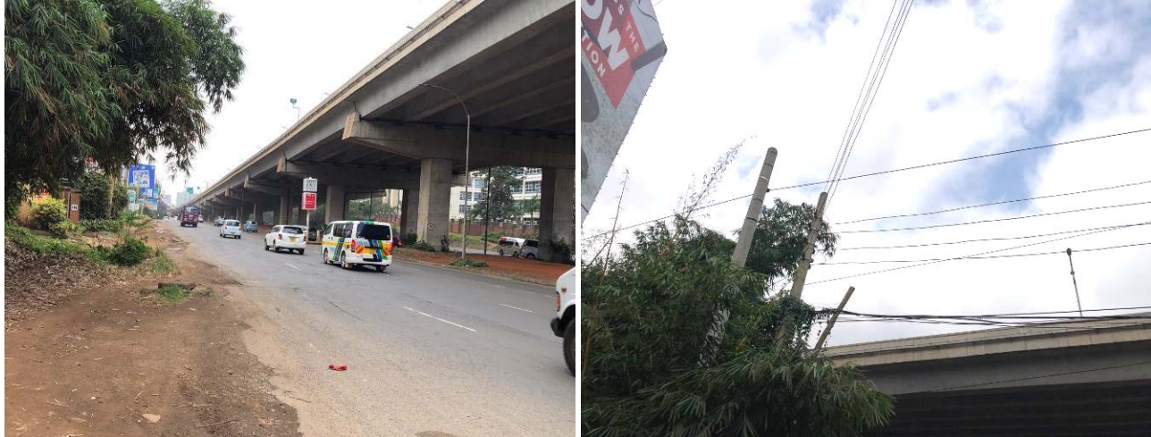
Plate 1: Part of infrastructural development in the area

The immediate access road is the Nairobi Expressway that is well connected to other roads.