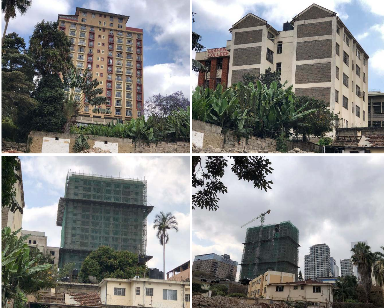
Plate 3: Some general developments in the neighborhood

Similar high-rise developments have been implemented in the general neighborhoods while others are ongoing.