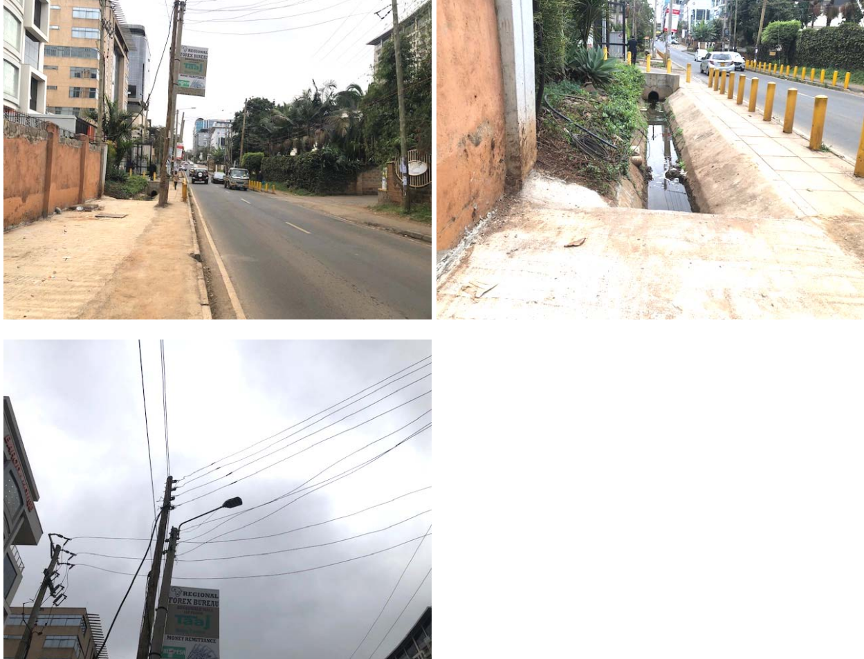
Plate 1: Part of infrastructural development in the area

The immediate access road is Muthithi Road that is well connected to other roads.