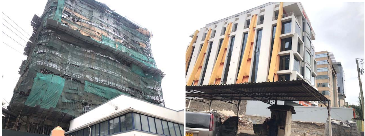
Plate 3: Some general developments in the neighborhood

Similar high-rise developments have been implemented in the general neighborhoods while others are ongoing.