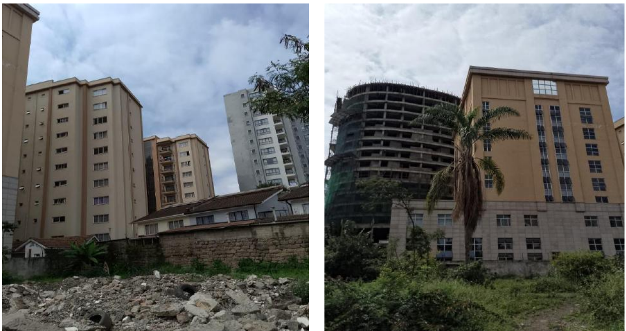
Figure 2: the project neighbourhood developments