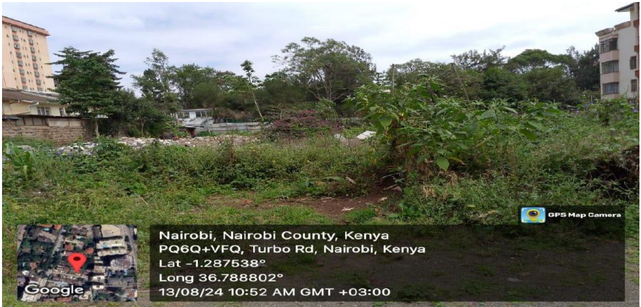
Figure 1. Proposed project site

The proposed project is to be established on land L.R. NO. Nairobi/Block 19/696 (LR No. 1/1380) which is currently undeveloped, along Turbo road, in Kilimani, Nairobi County measuring 0.3461 Hactares. The proposed project is located on coordinates 1°17'15.0"S 36°47'19.7"E as shown by the pin drop in the Figure 2 below. The proposed project is in line with the zoning of the area and the project neighbours are high rise buildings.