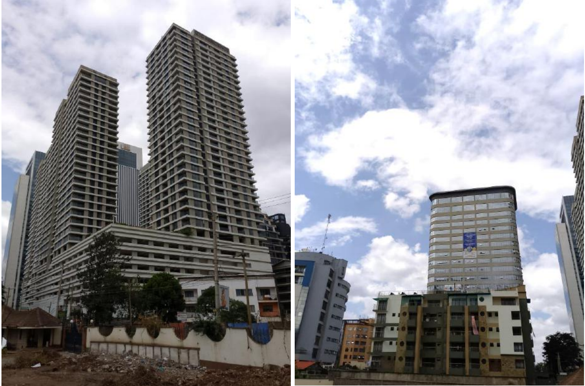
Figure 2: the project neighbourhood