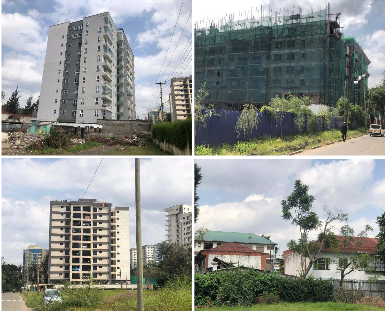
Plate 4: Some general developments in the neighborhood