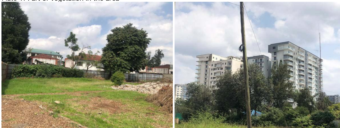
Plate 1: Part of vegetation in the area

There is no fauna/wildlife threatened by the development.