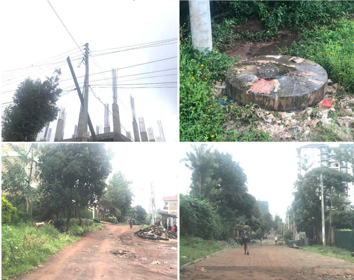
Plate 2: Part of infrastructural development in the area

The immediate access road is a murram road and therefore the site is well accessible.