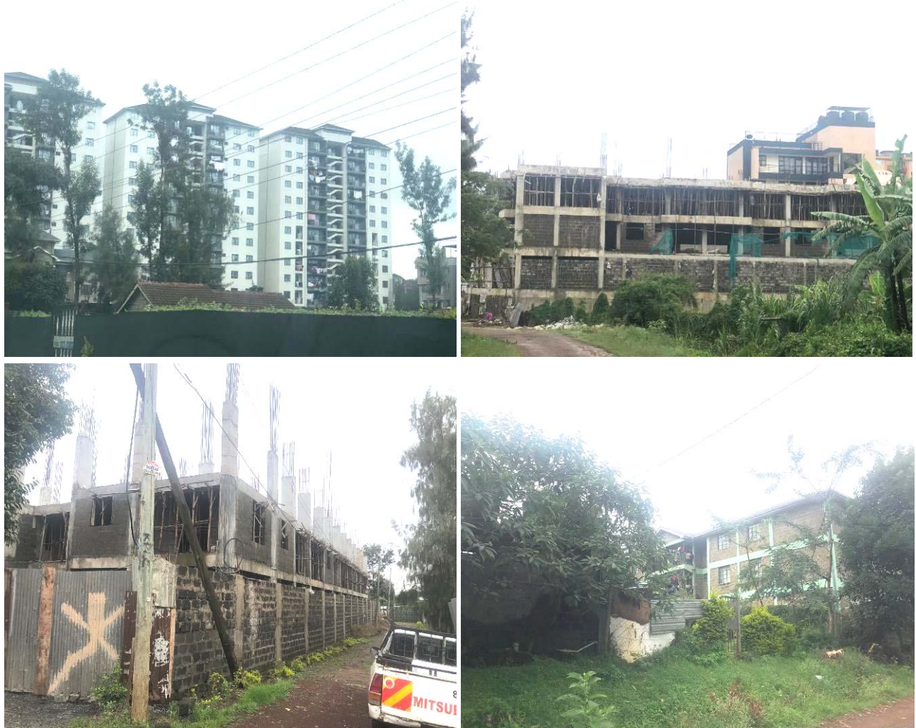
Plate 4: Some general developments in the neighborhood

Similar high-rise developments have been implemented in the general neighborhoods while others are ongoing.