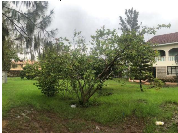
Plate 1: Part of vegetation at the site

There is no fauna/wildlife threatened by the development.