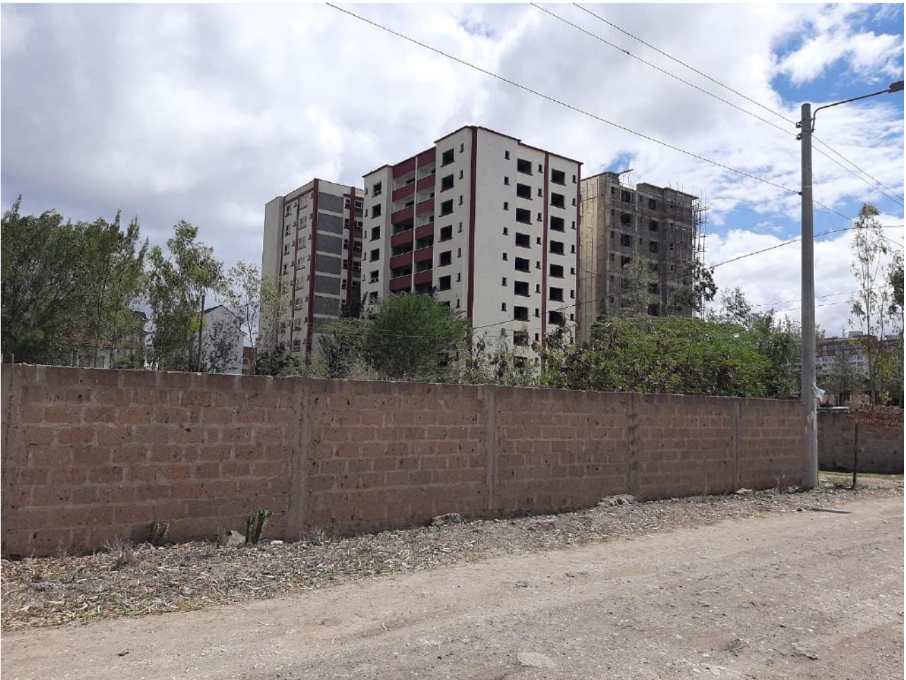
Figure 2: Neighbouring similar development