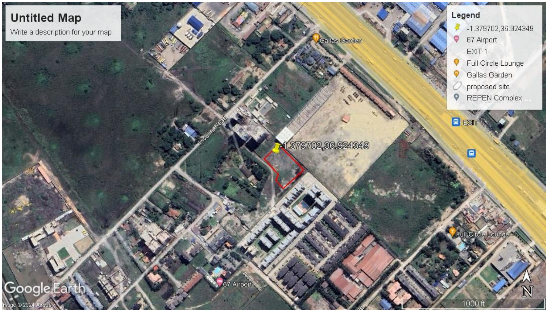
Figure 1: Proposed site location