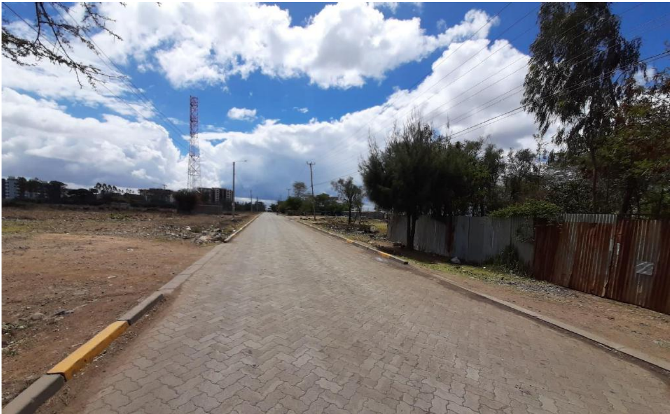
Figure 3: Access road to the proposed project area