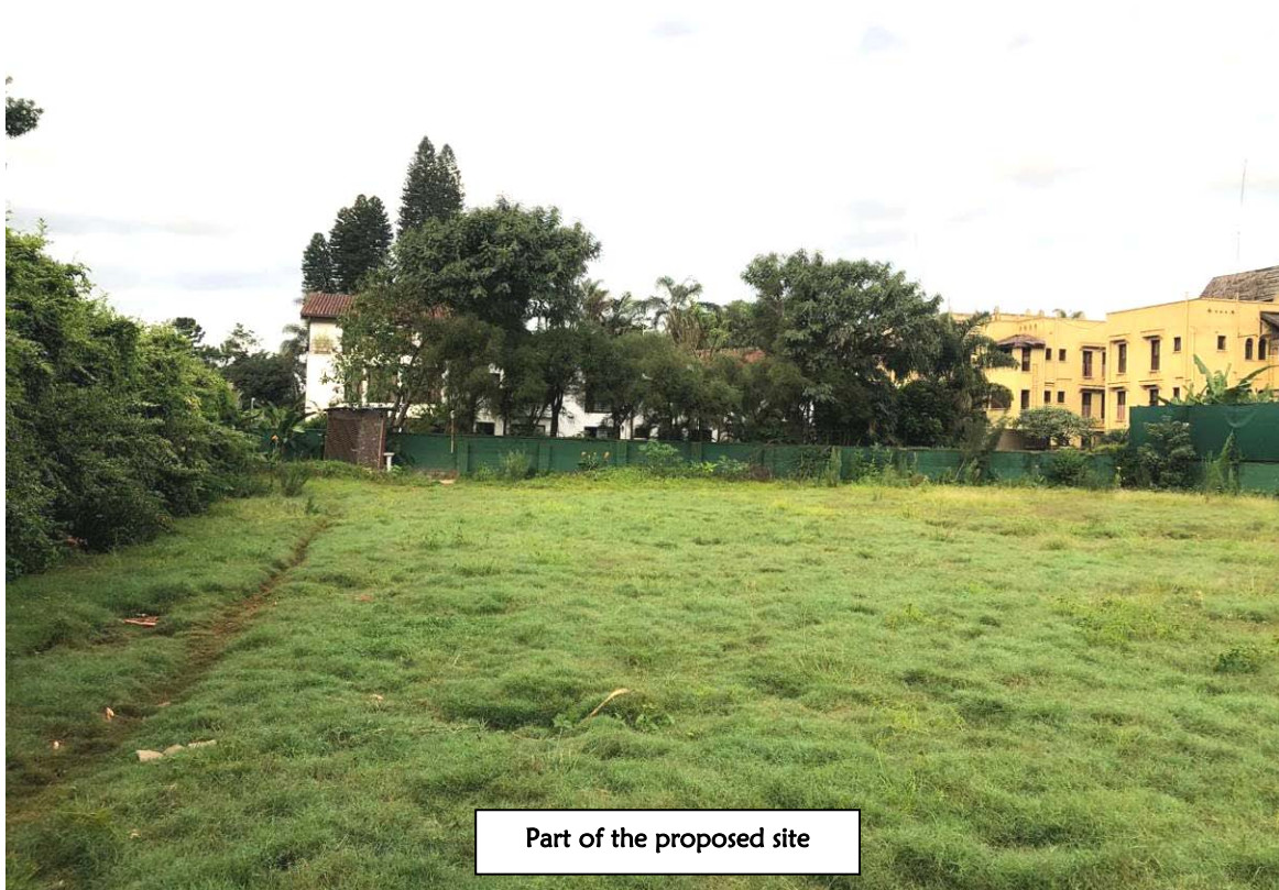
Part of the proposed site

(GPS Coordinates: Latitude -1.262190, Longitude 36.785372)