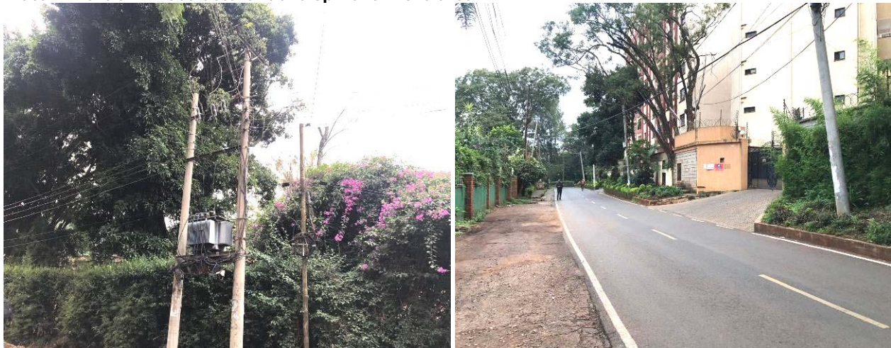
Plate 2: Part of infrastructural development in the area

The immediate access road is St. Michael's Road that is well connected to other roads including Church Road and Rhapta Road and therefore the site is well accessible.