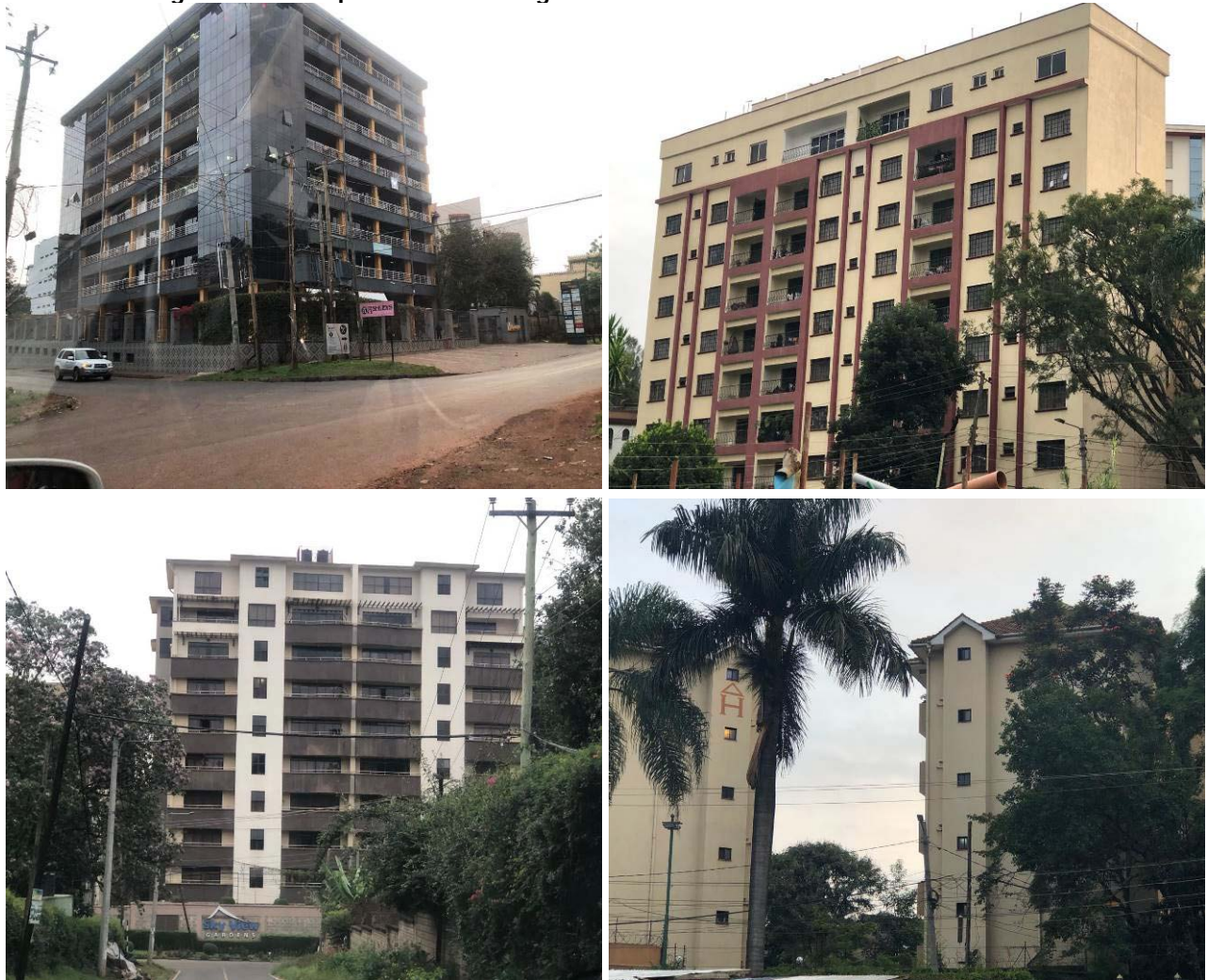
Plate 4: Some general developments in the neighborhood