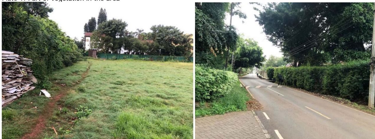
Plate 1: Part of vegetation in the area

There is no fauna/wildlife threatened by the development.