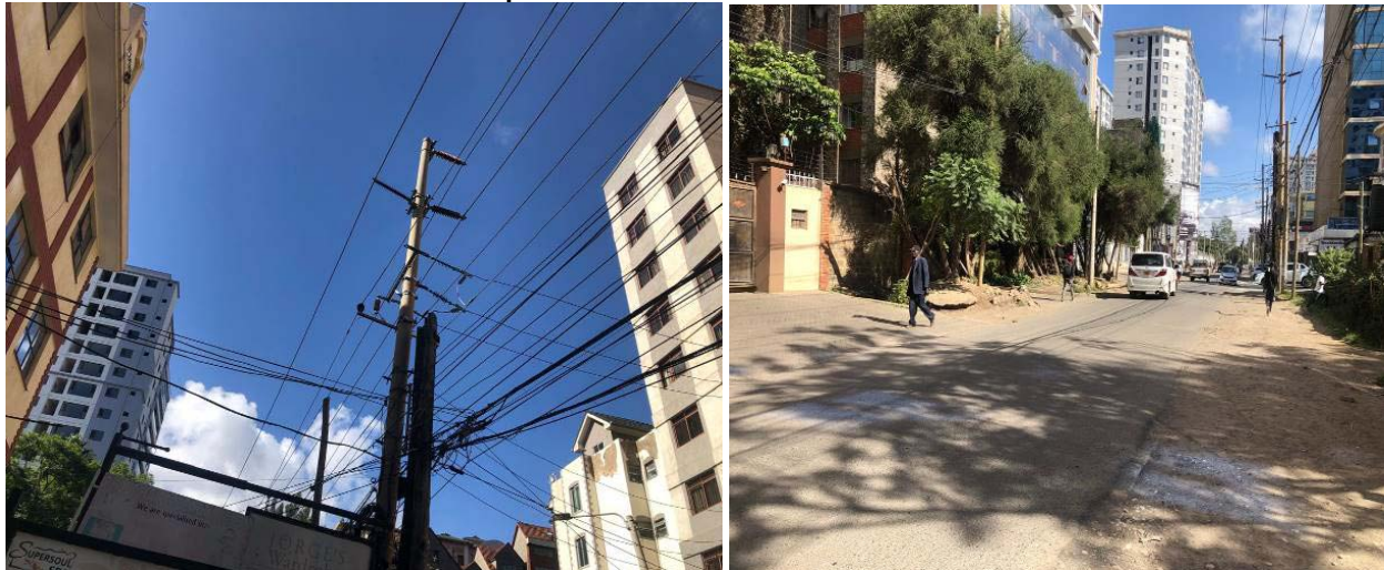
Plate 2: Part of infrastructural development in the area

The immediate access road is Wood Avenue that is well connected to other roads including Chania and Cotton Avenues, Argwings Kodhek and Ngong Roads and therefore the site is well accessible.