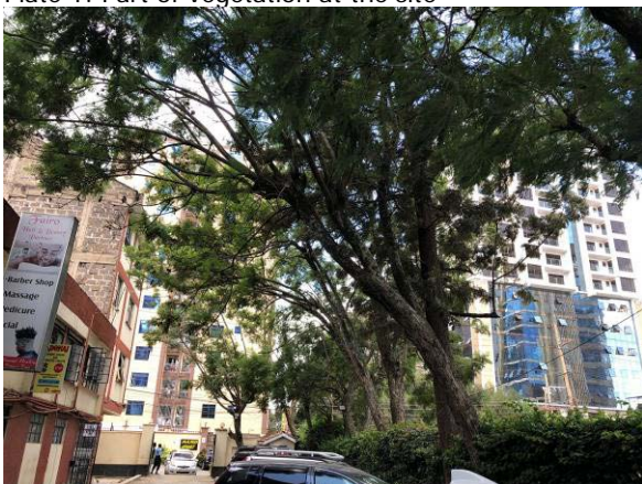
Plate 1: Part of vegetation at the site

There is no fauna/wildlife threatened by the development.