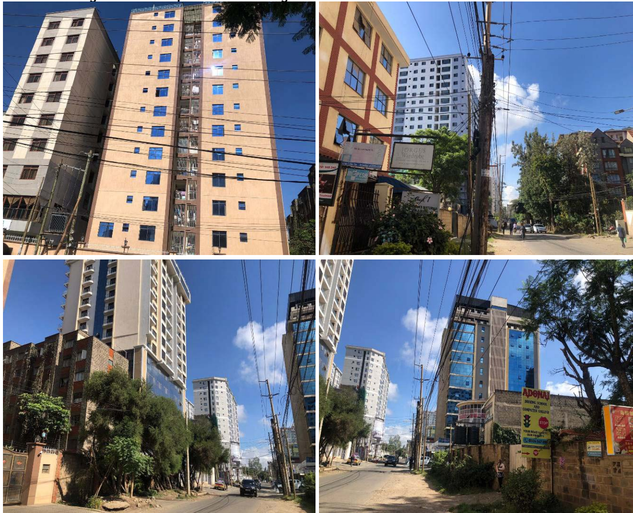
Plate 4: Some general developments in the neighborhood