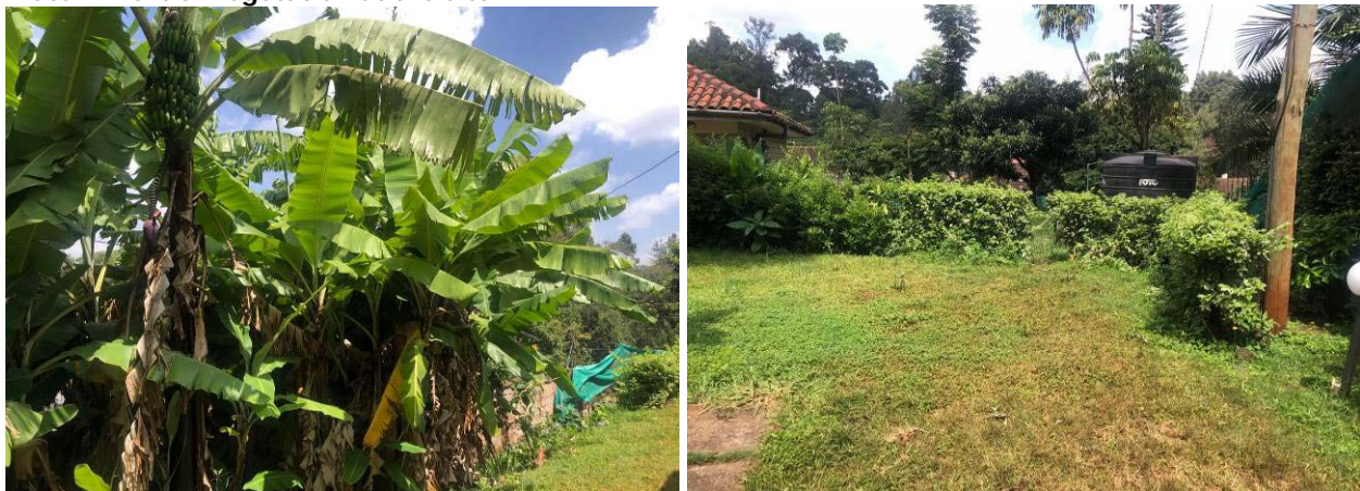
Plate 1: Part of vegetation at the site

There is no fauna/wildlife threatened by the development.