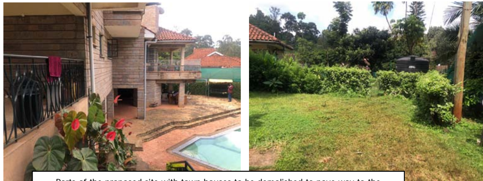
Parts of the proposed site with town houses to be demolished to pave way to the proposed project

(GPS Coordinates: Latitude -1.2770029, Longitude 36.7852747)