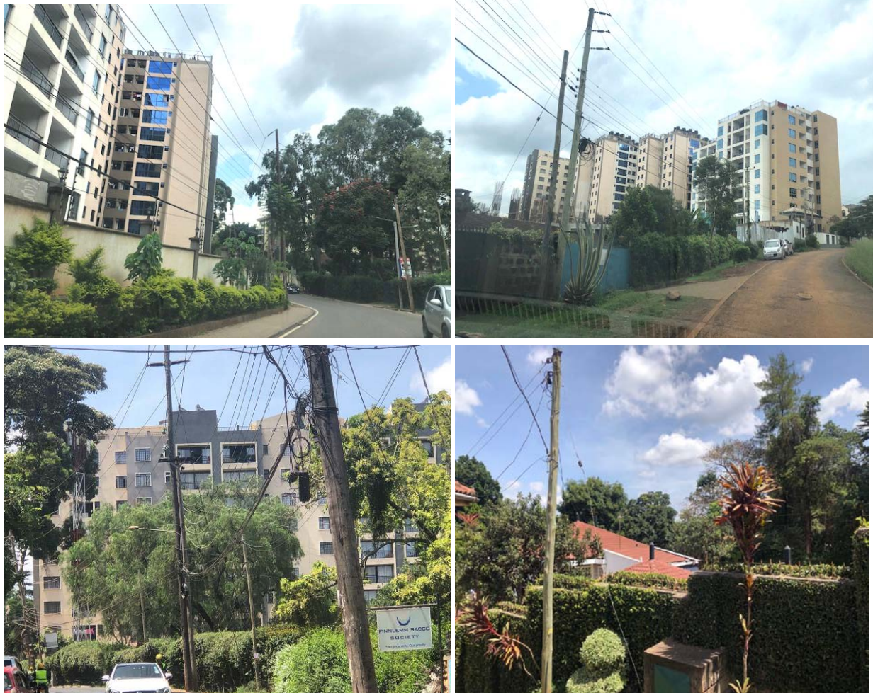
Plate 4: Some general developments in the neighborhood

Similar high-rise developments have been implemented in the general neighborhoods while others are ongoing.