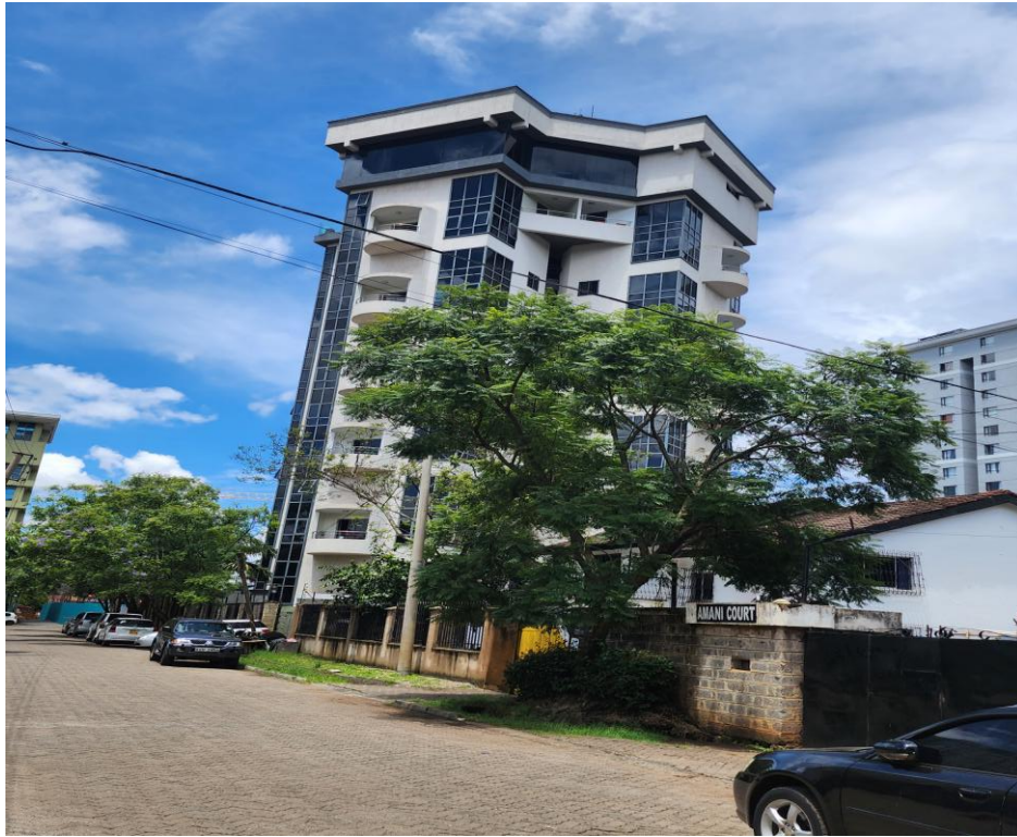
Plate 4: neighbourhood development - The Lofts (source; field survey)