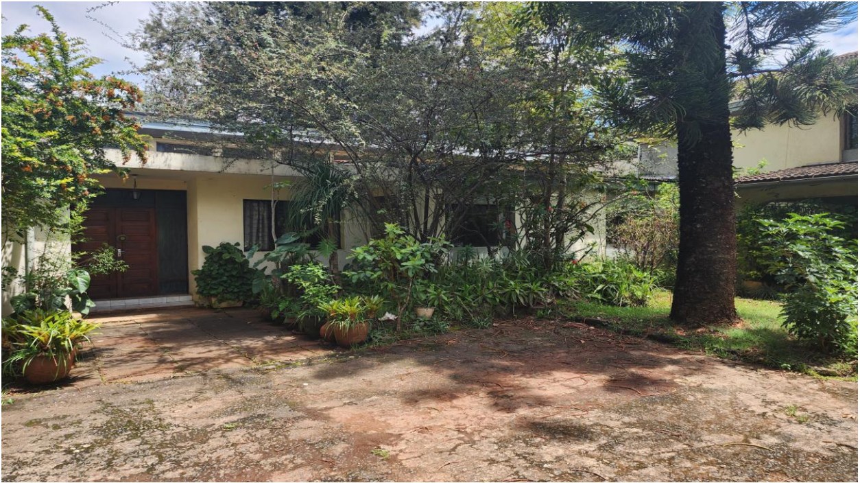
Plate 2: Proposed construction site with a house to be demolished