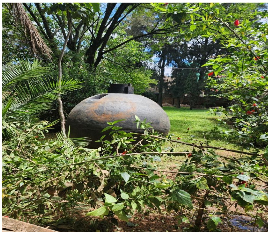
Plate 6: Vegetation on site