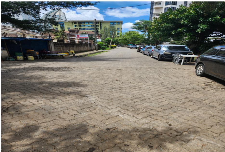
Plate 3: Access road from Wood Avenue