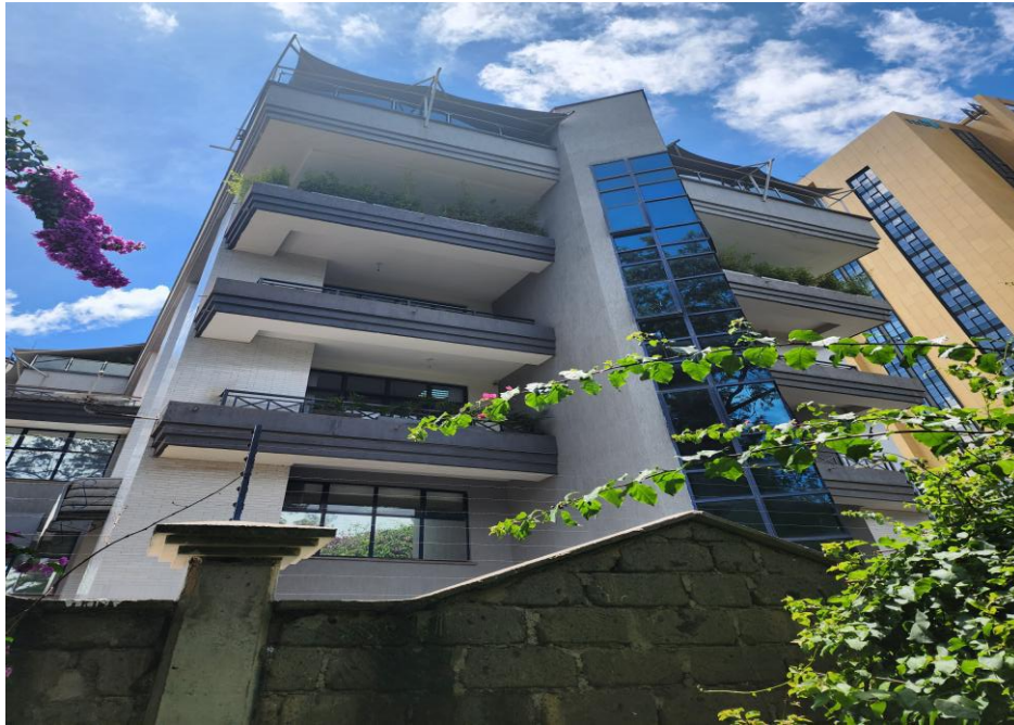
Plate 5: Immediate neighbourhood under construction