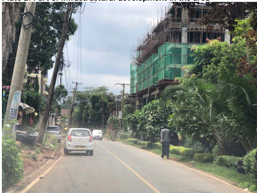
Plate 2: Part of infrastructural development in the area

The immediate access road is Githunguri Road that is tarmacked and well connected to other roads including Tabere Crescent, Ring Road Kileleshwa, Oloitoktok Road and therefore the site is well accessible.