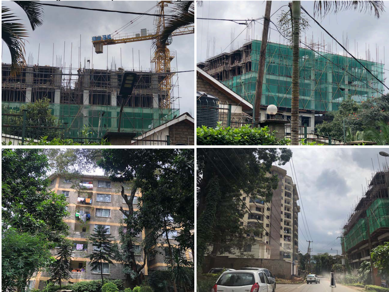
Plate 4: Some general developments in the neighborhood

Similar high rise developments have been implemented in the general neighborhoods.