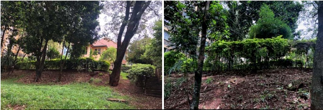
Part of the proposed site with a maisonette to be demolished to pave way to the proposed project

(GPS Coordinates: Latitude -1.278455, Longitude 36.795009)