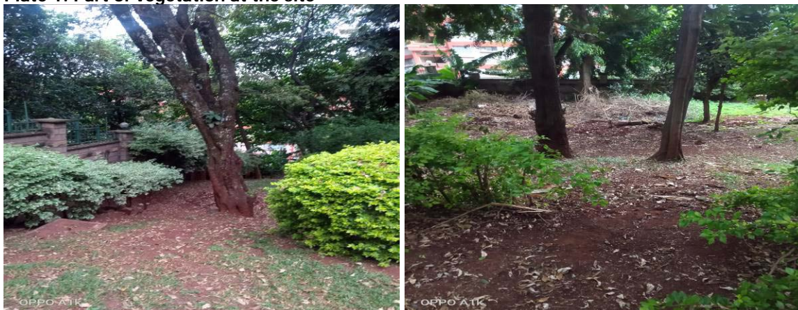
Plate 1: Part of vegetation at the site

There is no fauna/wildlife threatened by the development.