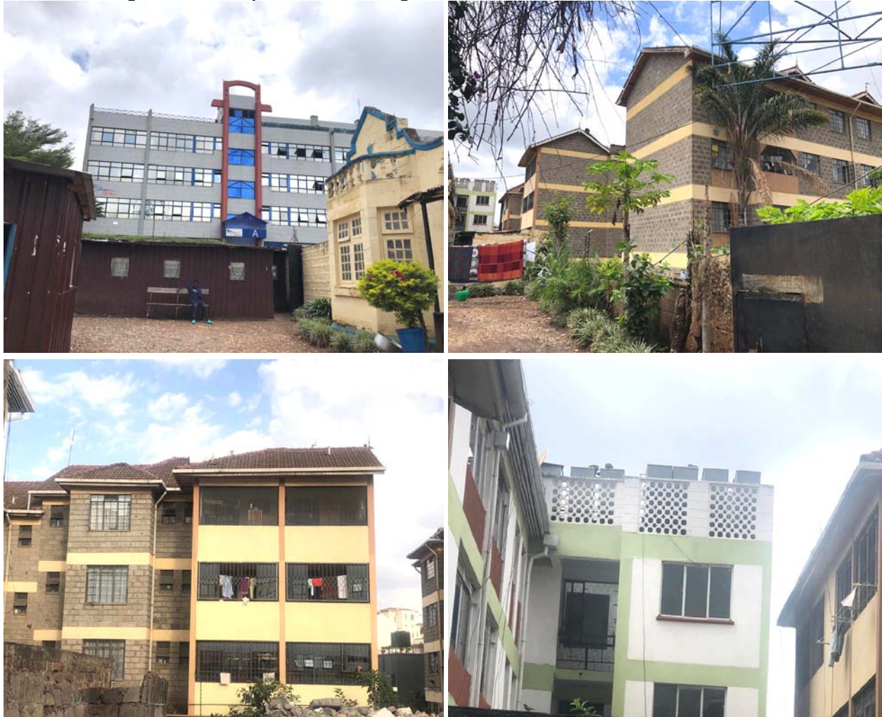
Plate 4: Some general developments in the neighborhood

Similar high-rise developments have been implemented in the general neighborhoods while others are ongoing.