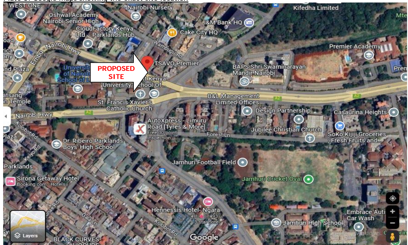
Plate 3: Google maps showing the exact site location

The proposed project site is Land Reference Number Nairobi/Block 34/149 in Parklands, Nairobi County.