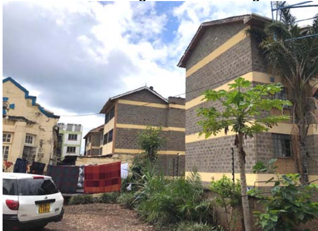
Plate 1: Some little vegetation in the neighborhood

There is no fauna/wildlife threatened by the development.