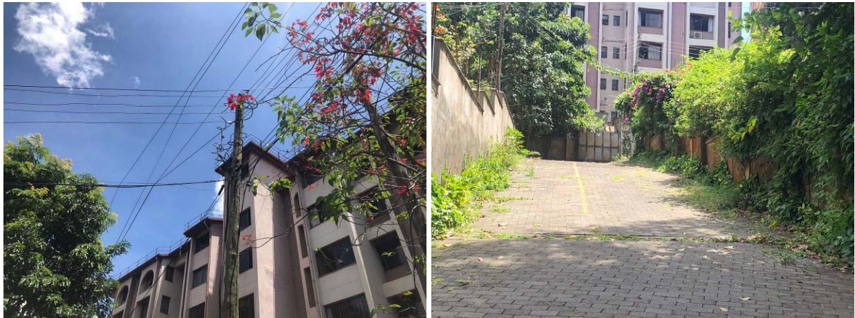
Plate 2: Part of the area's infrastructure

The area is well covered by all communication facilities such as landline, email and mobile services. All these will facilitate communication throughout the project cycle.