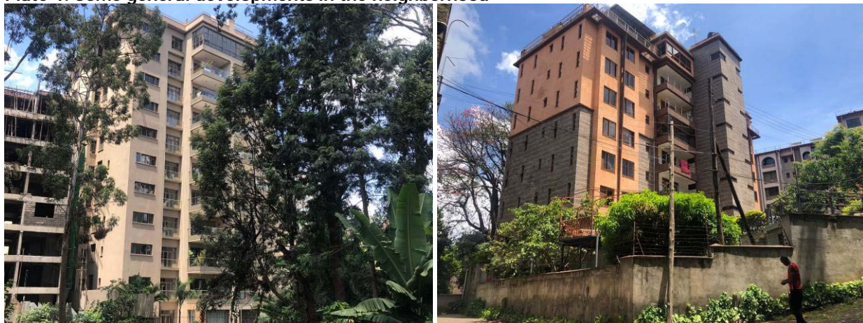
Plate 4: Some general developments in the neighborhood

The proposed project site is Plot L.R. No. Nairobi/Block 3/177 (Original No. 1870/IV/183) off Church Road in Westlands, Nairobi County. From the proposed designs, the essential set local standards (in terms of physical planning, minimum habitable rooms, basic facilities, health and safety) have been met. The land is registered in the name of the proponent. (Please find the attached ownership documents). Similar high-rise developments have been implemented in the general neighborhoods while others are ongoing.