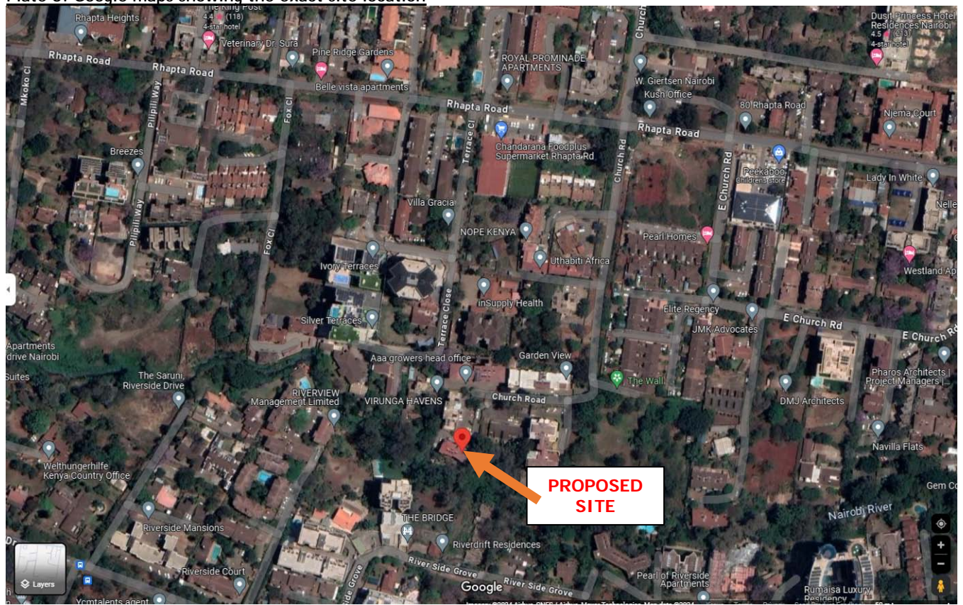
Plate 3: Google maps showing the exact site location