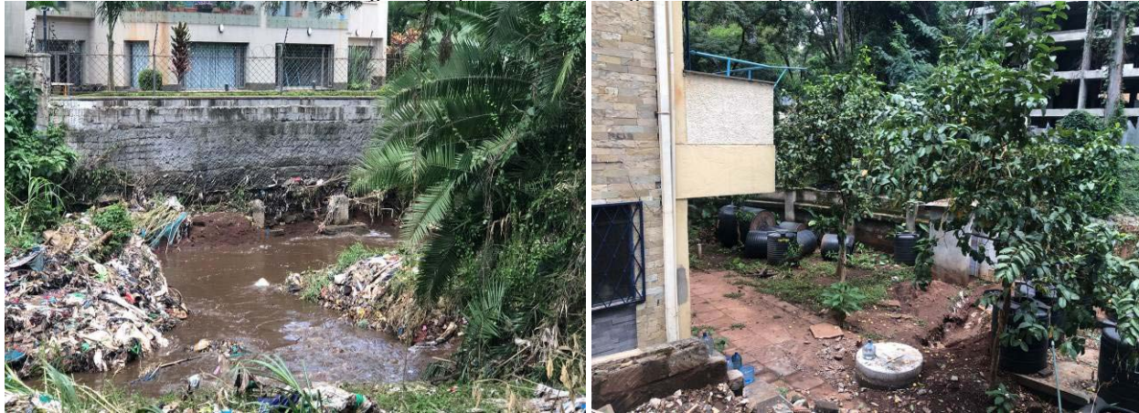
Plate 1: Part of Nairobi River bordering the proposed site and vegetation at the proposed site