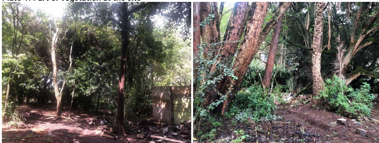
Plate 1: Part of vegetation at the site

There is no fauna/wildlife threatened by the development.