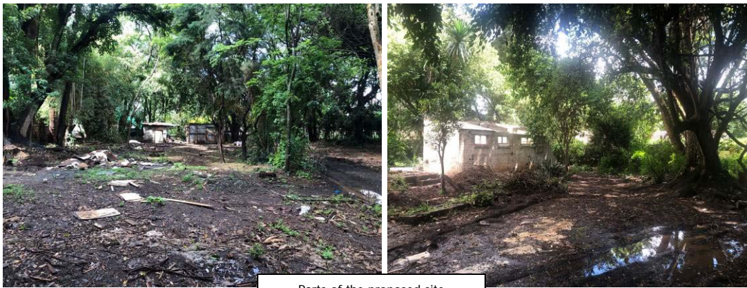
Parts of the proposed site

(GPS Coordinates: Latitude -1.297321, Longitude 36.777083)