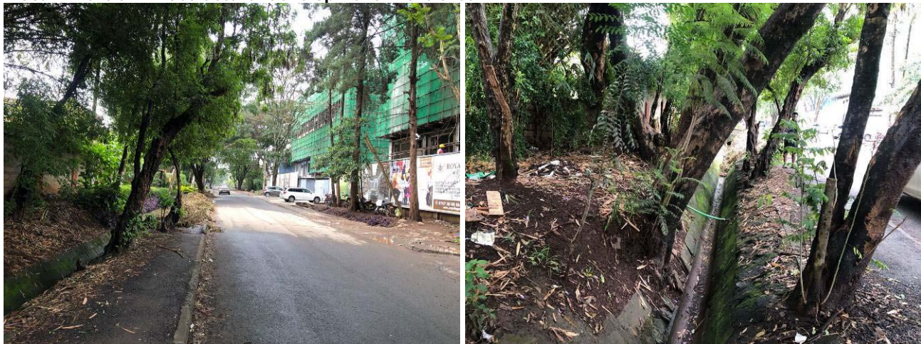
Plate 2: Part of infrastructural development in the area

The immediate access road is Ndemi Road that is well connected to other roads including Kilimani Road and therefore the site is well accessible.