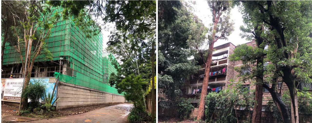
Plate 4: Some general developments in the neighborhood