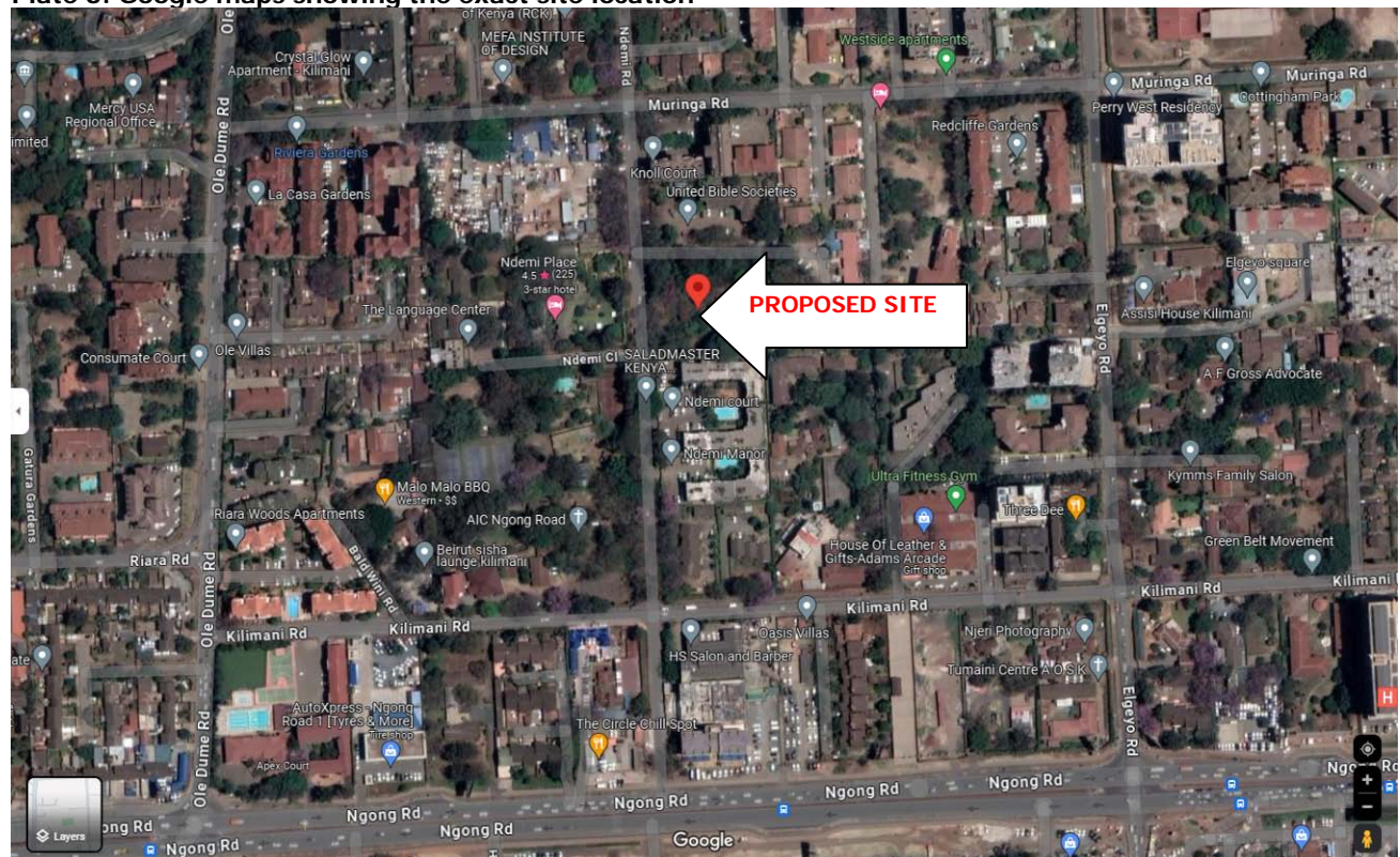
Plate 3: Google maps showing the exact site location