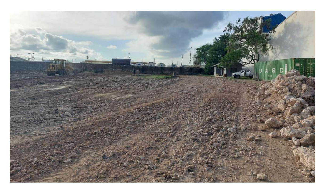
Figure 4: Current state of the site

mongooses are also present, though their populations may be impacted by habitat loss and human activity. The site has a few trees that the proponent may consider maintaining and establishing others to make the site more aesthetic.