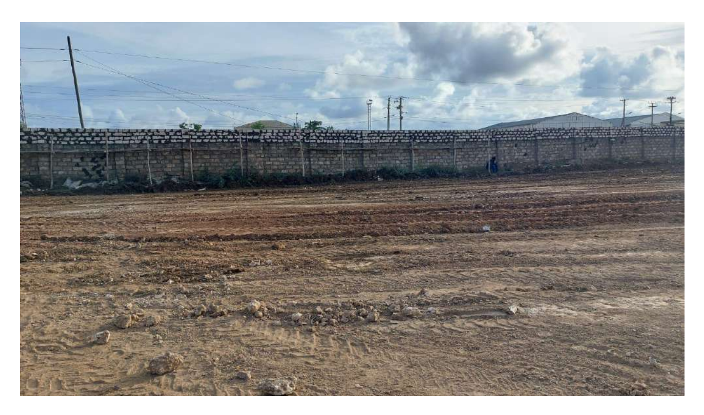
Figure 3: The undeveloped site

The proposed project will be located on Plot L.R No. MN/V/1692, Jomvu, Mombasa County. The geographic coordinates of the (S 4°0'30.71952, E 39°35'59.19504). The site to be set up has been zoned as industrial/commercial area by the County Government of Mombasa.