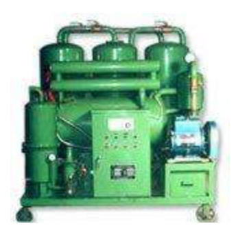
Plate 1: Spent Oil Recycling Machine

The proposed decanting process has been preferred as it is relatively cheap and uses locally available technology.